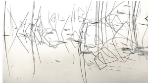
Miro Fish $800