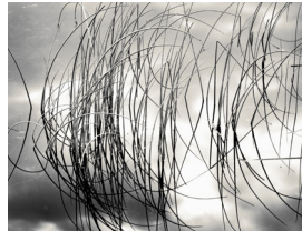
Khaos Tules $700