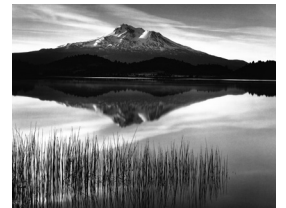
Tule and Mt. Shasta