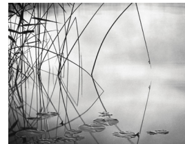
Lily Pads and Tules $1000