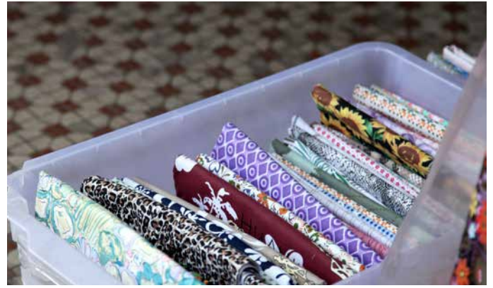
Damaged textile waste is unfinished textiles that have been damaged, for example colour or print defects.