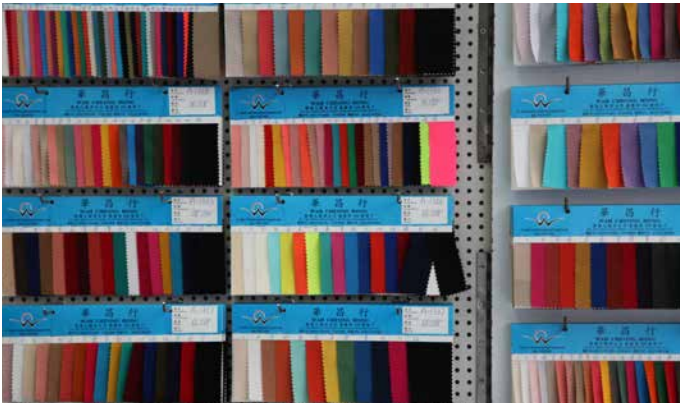
Textile swatch waste are leftover textile samples.

Pre-consumer textile waste is waste generated in the fashion supply chain before the textile reached the consumer.