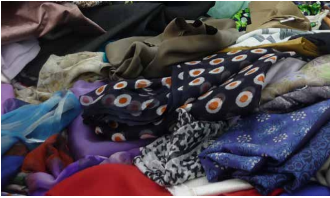
Sampling yardage waste is factory surplus sample textiles that have been leftover from textile sample manufacturing.