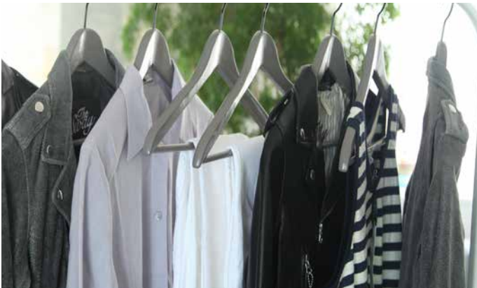
Clothing sample waste is part-finished or finished clothing samples from the design and production of clothing, which have not been worn by consumers.