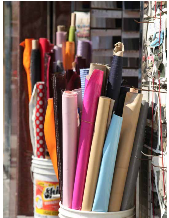
End-of-roll textile waste is factory surplus textile waste leftover on the textile rolls from garment manufacturing.