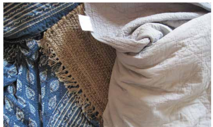
Secondhand textile waste is any textile waste (such as home furnishings or any non-clothing waste) that have been used and discarded by consumers.