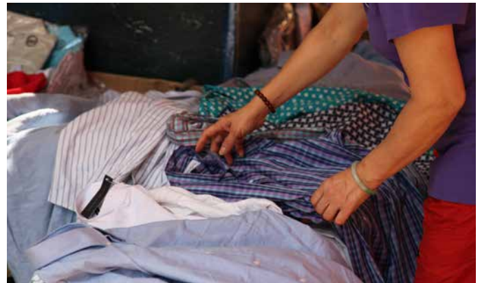
Unsold clothing waste is clothing waste (finished or unfinished) that has not yet been used

Post-consumer textile waste is waste generated and collected after the consumer has used and disposed of it.