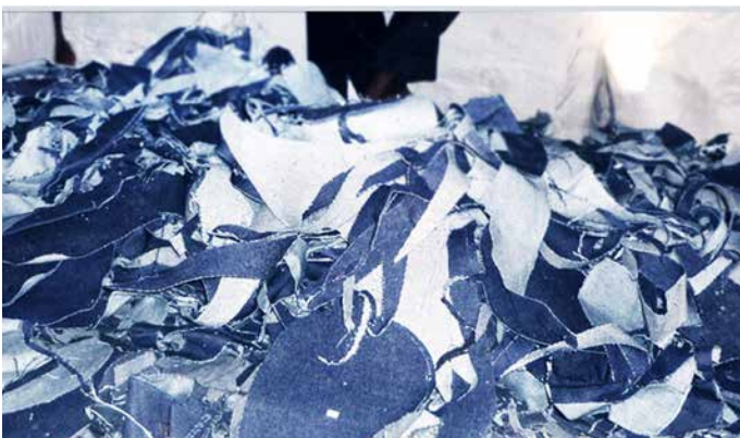
Cut-and-sew textile waste is textile scraps generated during garment manufacturing.