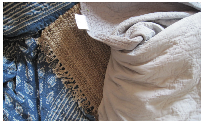
Secondhand textile waste is any finished non-clothing textiles (such as curtains, bedding etc) that have been owned and then discarded by consumers (both used and unused).