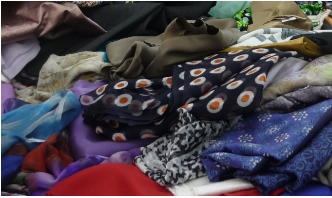
Sampling yardage is factory surplus waste leftover from textile sample manufacturing.