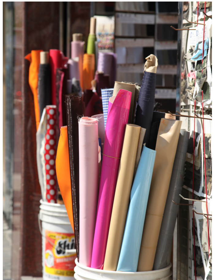
End-of-rolls are factory surplus textiles that have been left over from garment manufacturing.