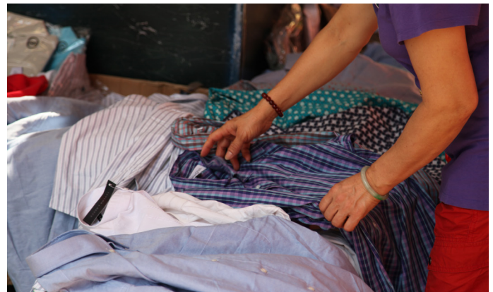
Unsold clothing waste is clothing (finished or unfinished) that has not been sold.

Post-consumer textile waste is waste collected after the consumer has disposed of it.