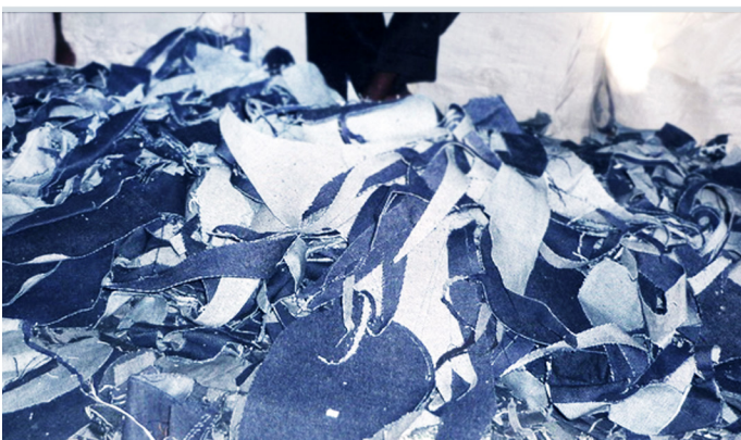
Cut-and-sew waste is textile scraps generated during garment manufacturing. It is often considered waste and is discarded due to its uneven and small formats.