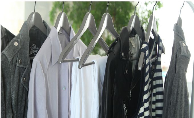
Clothing samples are part-finished or finished clothing samples from the design and production of clothing.