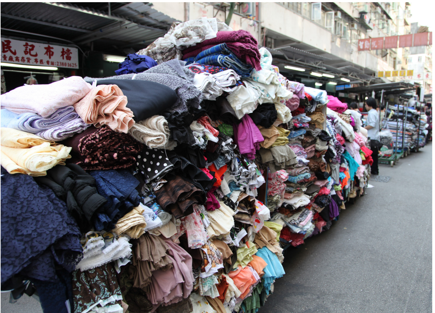
Sham Shui Po in Hong Kong is an incredible source for end-of-rolls, fabric swatches and textile samples. It is a regular sourcing ground for Hong Kong and overseas designers, also coupled its proximity to China's plentiful garment factories.

Depending on where you live, there are textile shops and markets selling end-of-roll textiles and samples. Regardless of where you live, contact textile shops and ask them if they have any samples available.