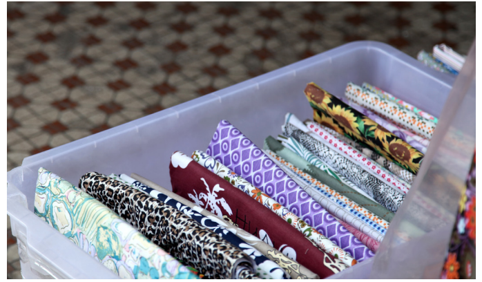
Damaged textiles are unused textiles that have been damaged for example with colour or print defects, rendering them unusable.