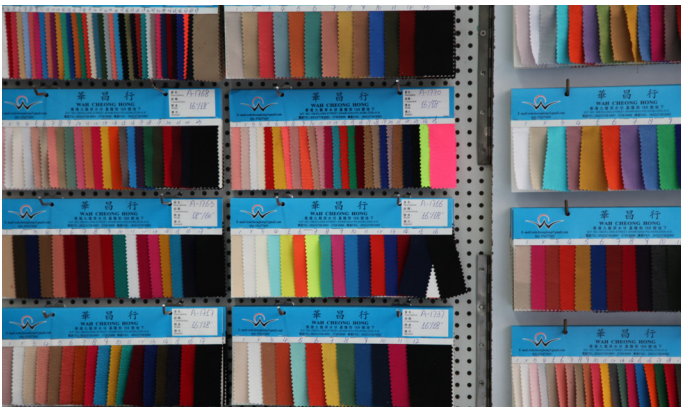
Textile swatches are leftover textile sample swatches from the production process.

Pre-consumer textile waste is made up of manufacturing waste that has not reached the consumer.