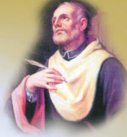
St. John Cantius Church