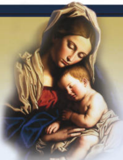
St. Mary's Cathedral