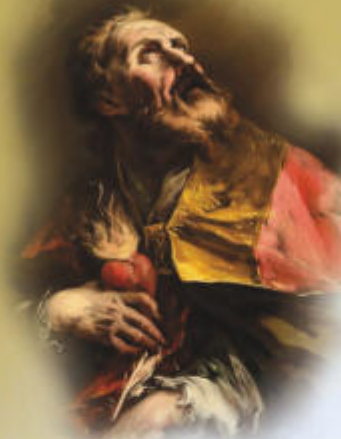
Church of St. Augustine