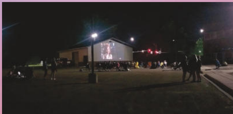
Movie Night at St. Augustine