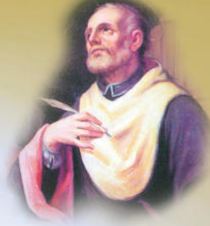
St. John Cantius Church