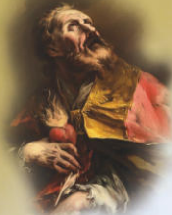
Church of St. Augustine