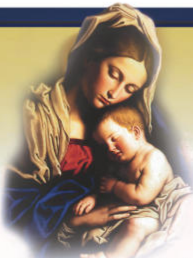
St. Mary's Cathedral