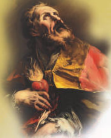
Church of St. Augustine