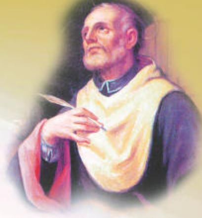
St. John Cantius Church