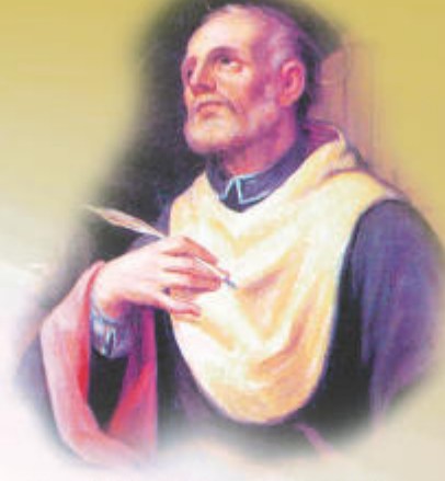
St. John Cantius Church