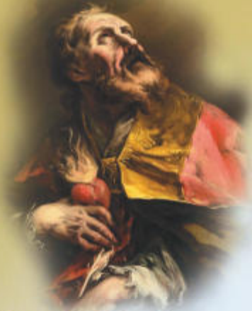
Church of St. Augustine