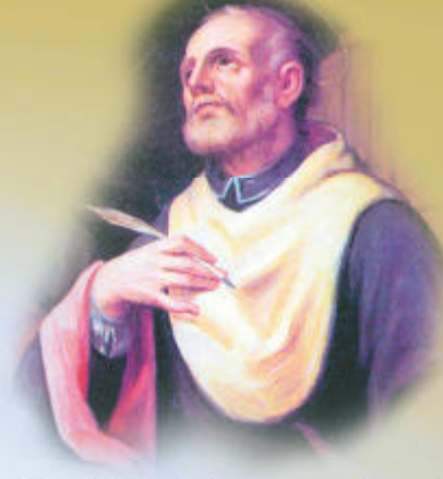
St. John Cantius Church