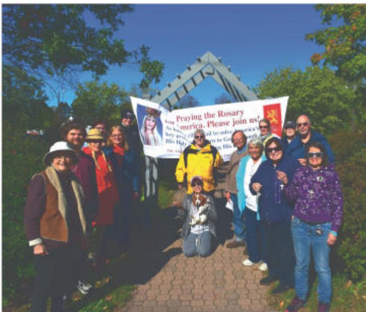
October 16 Rosary Rally at St. John Cantius Mary Garden.