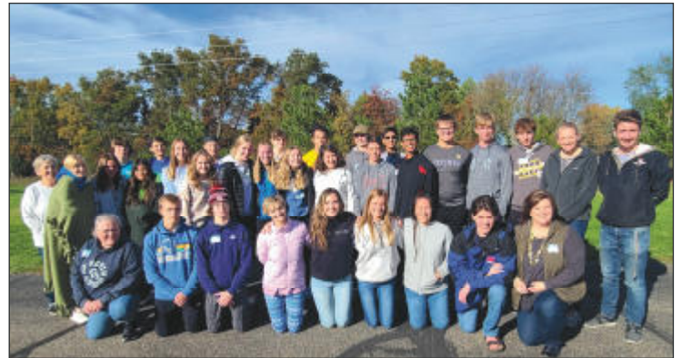
Students in the Confirmation Fall Session took part in a retreat on October 21.