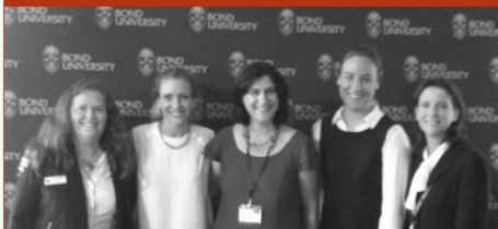
At the Bond University in Australia on April 5

As our international network of Women In Sports Law expands, we look forward to exchanging ideas with colleagues from different countries and with different backgrounds. Join us for our 1 st Annual Conference & General Assembly that will be held in Madrid on November 16 and let us know of your ideas for new projects and services to our WISLaw members!