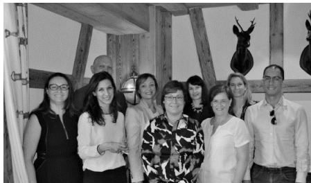
With our Hon. President Moya Dodd in Zurich on April 7, 2017