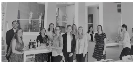
WISLaw talk in Zurich (FIFA) on June 29