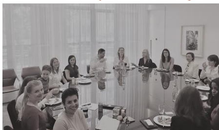
WISLaw talk on Brexit in London on June 26