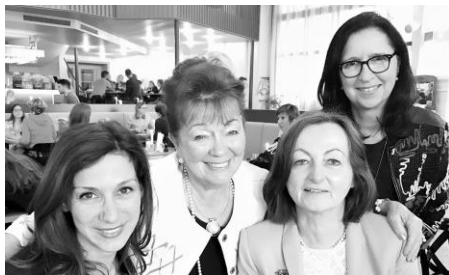
With our WISLaw hon. President & hon. members in Lausanne on May 12, 2017

We do our best to make sure that all our members appear on our members' directory and receive our newsletters / emails. If you haven't done so already, please send us your contact details / picture / affiliation! Thank you.