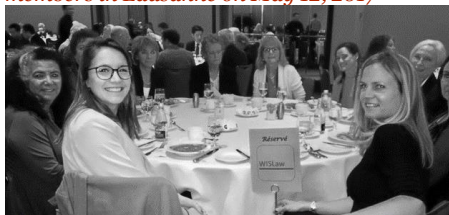
At the SDRCC Annual Conference in Quebec City on May 5, 2017