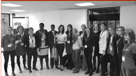
At the WADC conference in Macolin (CH)

We are excited to announce that our first WISLaw Annual Conference & General Assembly will be held in Madrid (prior to the Football Law Congress organized by the Spanish Football Federation) on November 16 2017, exactly one year after the launch of WISLaw! We will exchange ideas and discuss new projects including all our members. Join us for an exciting all-day conference! Let us know if you would like to get involved in the conference as speakers / panelists / members of the organizing committee ( events.wislaw@gmail.com ).