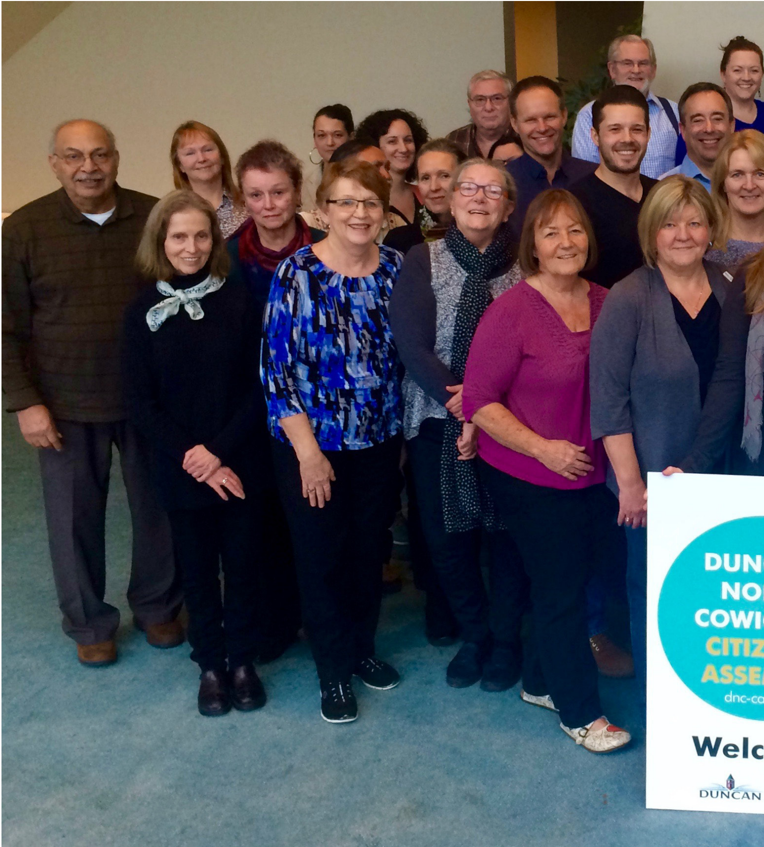
Members of the Citizens' Assembly meet on their first day, January 21, 2017