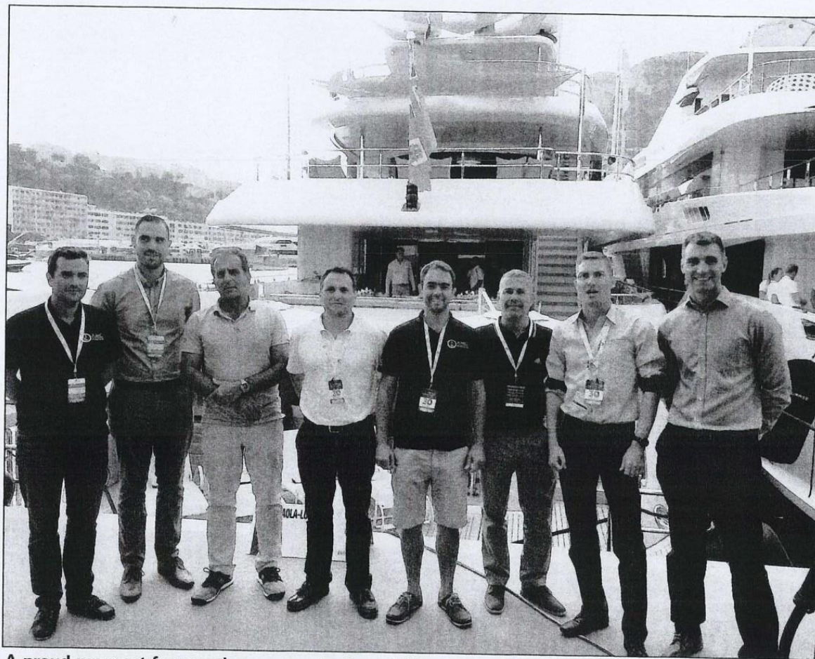
A proud moment for members present when visiting a new build registered in Gibraltar, two of the nine crew actually from Gibraltar as well.