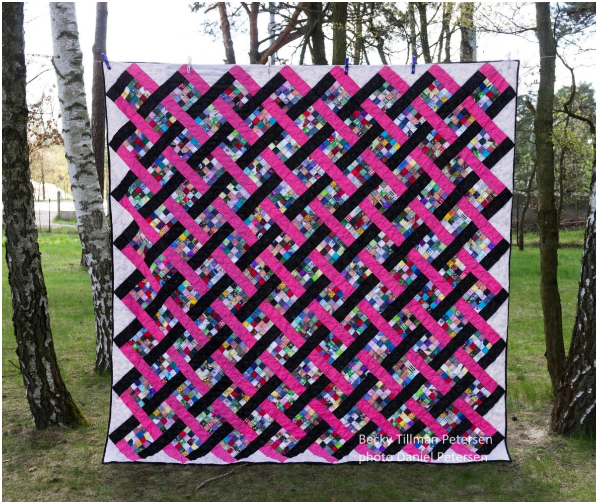
Becky Tillman Petersen Becky Quilts in the Old Country