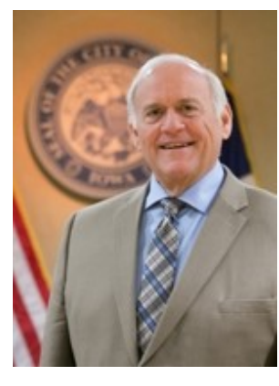
Frank Klipsch Mayor of Davenport, IA