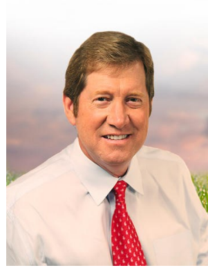
Congressman Jason Lewis (MN)