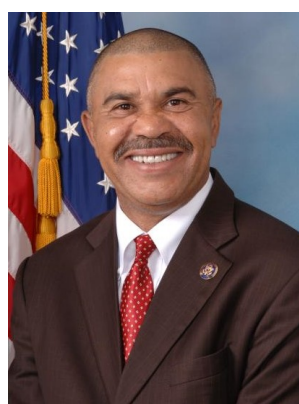
Congressman Lacy Clay (MO)