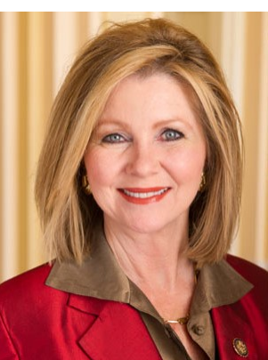
Congresswoman Marsha Blackburn (TN)