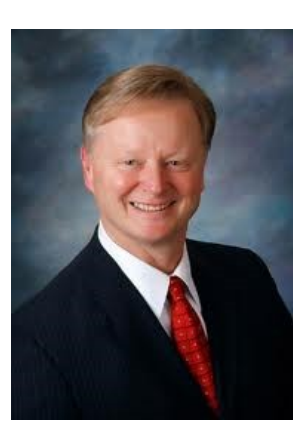
Roy Buol Mayor of Dubuque, IA