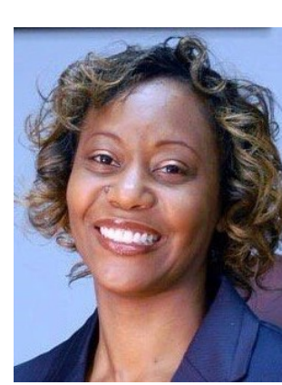
Emika-Jackson Hicks Mayor of East St. Louis, IL