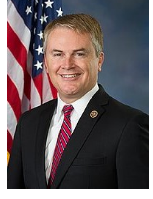
Congressman James Comer (KY)