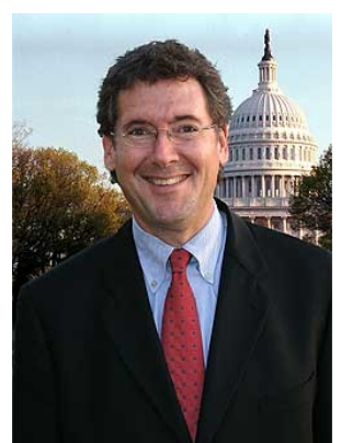
Congressman Gregg Harper (MS)