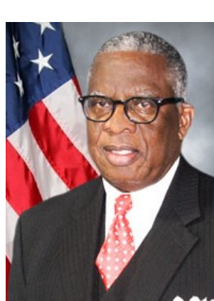
George Flaggs Mayor of Vicksburg, MS