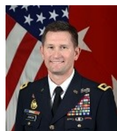
MG Donald E. Jackson Deputy Commanding General Civil & Emergency Operations U.S. Army Corps of Engineers