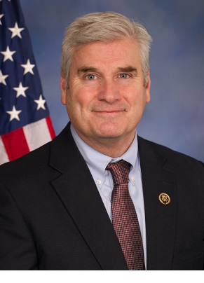
Congressman Tom Emmer (MN)