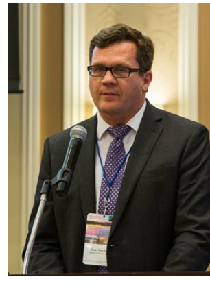
Tim Kabat Mayor of La Crosse, WI