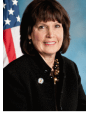
Congresswoman Betty McCollum (MN)