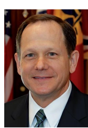
Francis Slay Mayor of St. Louis, MO