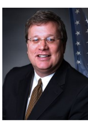
Jim Strickland Mayor of Memphis, TN