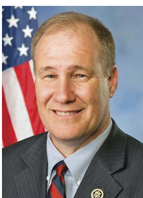
Congressman Trent Kelly (MS)