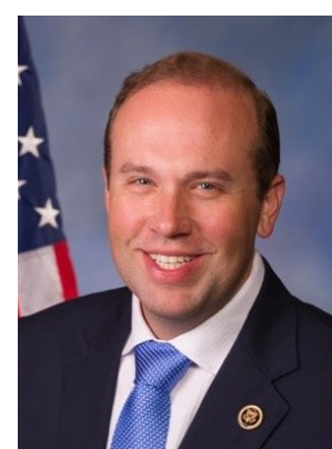
Congressman Jason Smith (MO)