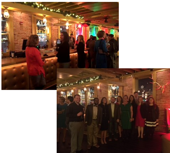
On November 30, our Young Lawyers welcomed the New Admittees with a reception at Ink N Ivy.