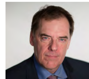
JOHN IBBITSON #1 bestselling author, award-winning political journalist and writer at large for the Globe and Mail