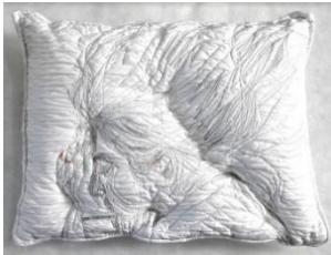
Sleep Series (2014) Sewing on Pillow 70 x 90 cm £3000