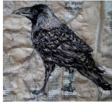
Indian House Crow Free motion stitch on calico 27 x 27 cm SOLD