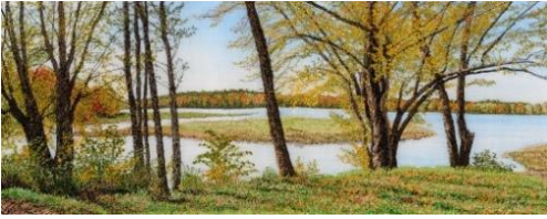
As the Rivers Slipped By Freehand machine embroidery Deka silk paint 33 x 53 cm £1850