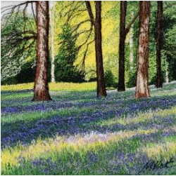
Through Fingers of Light 28 x 28 cm SOLD