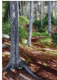
Those Dappled Trails Freehand machine embroidery, Deka silk paint 28 x 33 cm £895