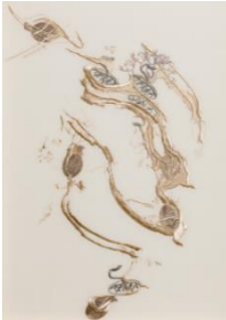
Entangled I Triptych I 100% Silk Crepe de Chine satin 47 x 65 cm £995