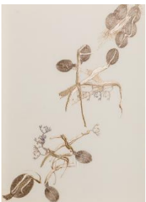
Entangled V Triptych II 100% Silk Crepe de Chine satin 47 x 65 cm £995