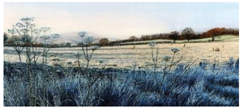
One Frosty Morning Freehand machine embroidery 48 x 81 cm £6950