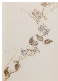
Entangled VI Triptych II 100% Silk Crepe de Chine satin 47 x 65 cm £995

26 Church Street London NW8 8EP 0207 724 7230