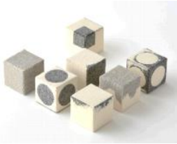
Units of Time Hand Embroidery on wool 5 x 5 x 5 cm £2400