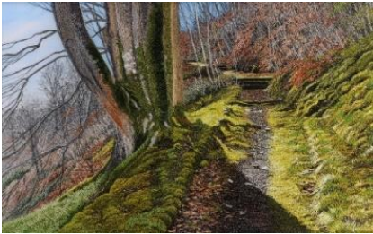
Moss Beneath My Feet Freehand machine embroidery Deka silk paint 25 x 40 cm £5950