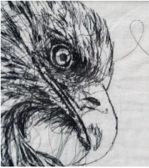
Eagle Free motion stitch on calico 25 x 25 cm SOLD