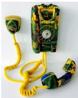
Hold on ... Vintage Telephone Embroidery £1000