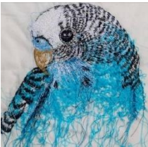
Peter Free motion stitch on calico 30 x 30 cm SOLD