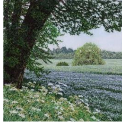
Amongst the Linseed 28 x 28 cm SOLD