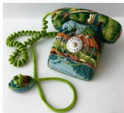
Springtime Dialog Vintage Telephone Embroidery £1000