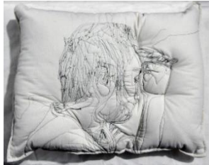
Sleep Series (2014) Sewing on Pillow 70 x 90 cm SOLD