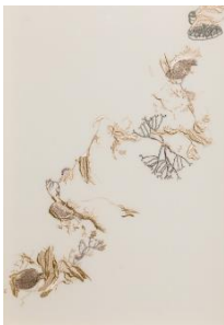
Entangled III Triptych I 100% Silk Crepe de Chine satin 47 x 65 cm £995