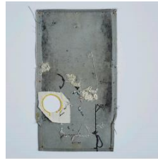
My Grey Pencil Case 22 x 39 cm £1500