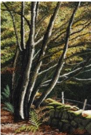
The Old Wall Freehand machine embroidery, Deka silk paint 28 x 33 cm £895