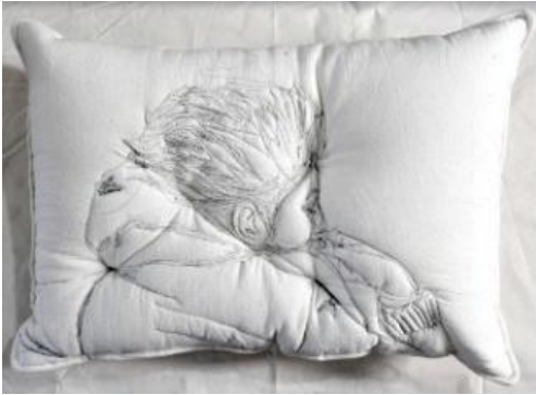
Sleep Series (2014) Sewing on Pillow 70 x 90 cm SOLD