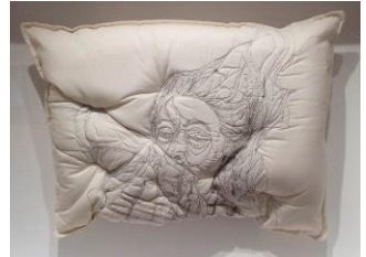
Sleep Series (2014) Sewing on Pillow 70 x 90 cm SOLD