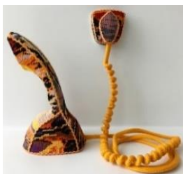
I will call you Vintage Telephone Embroidery £1000