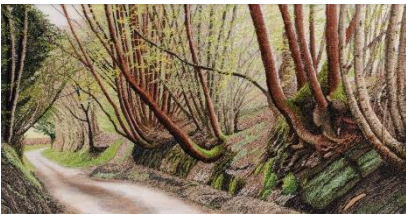
Bare Roots and Springtime Freehand machine embroidery 40 x 56 cm £3200