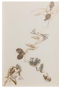
Entangled IV Triptych II 100% Silk Crepe de Chine satin 47 x 65 cm £995