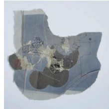
Processed Hand embroidery on printed and dyed wool 50 x 44 cm £1800