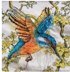
Kingfisher Free motion stitch on calico 30 x 40 cm SOLD