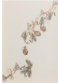
Entangled II Triptych I 100% Silk Crepe de Chine satin 47 x 65 cm £995