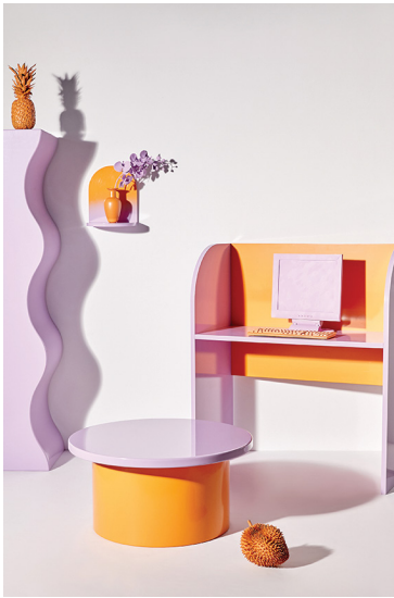
Objects for Objects