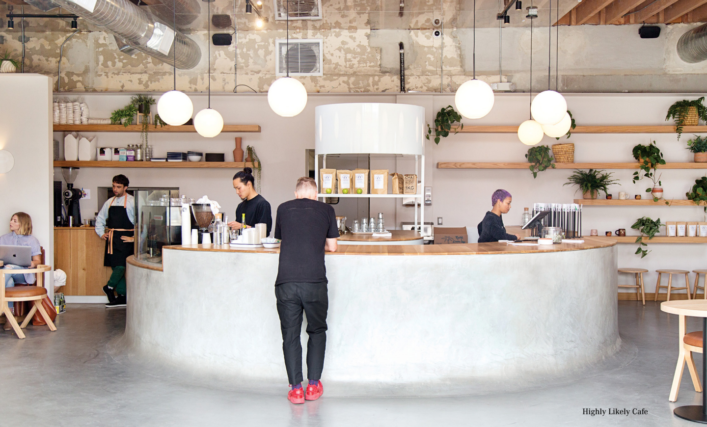
Highly Likely Cafe