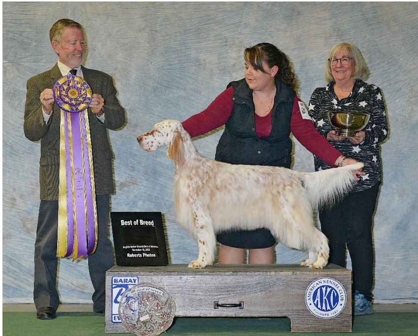
Pictured GCH CH Set'r Ridge's Set-Point Bellini JH (Tessa) going Best in National Regional Speciality