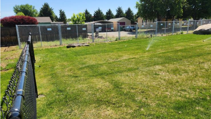
The east Training Ring looking toward the East. Probable location of storage shed for Agility equipment.