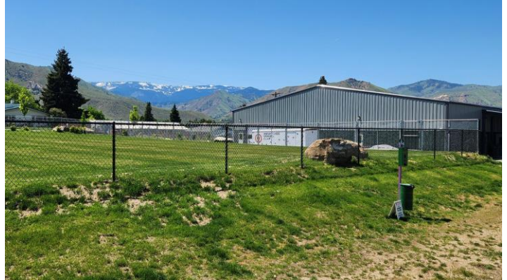
The east Training Ring looking toward the Southwest