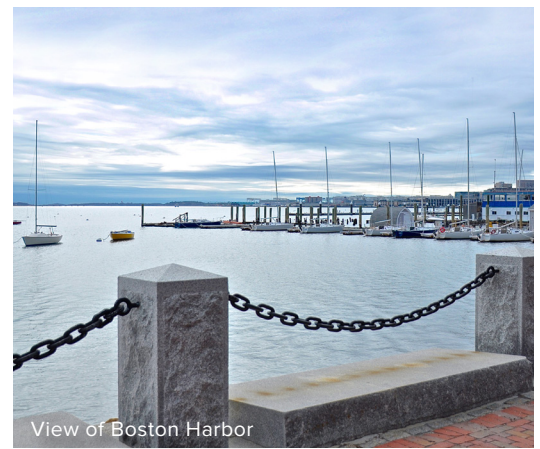
View of Boston Harbor