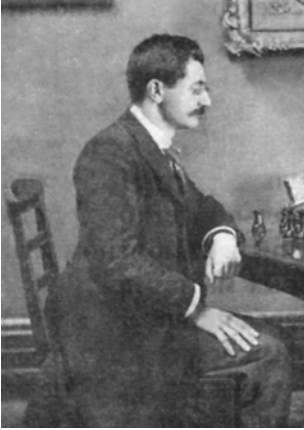
Emanuel Lasker, the second world chess champion, held the title longer than any other player, 27 years.

“I never enjoyed the American sports, but I did become more interested in the chess, at which I improved. My real passion was reading, and after the War I learned much more about the match my kinsman had contested.”