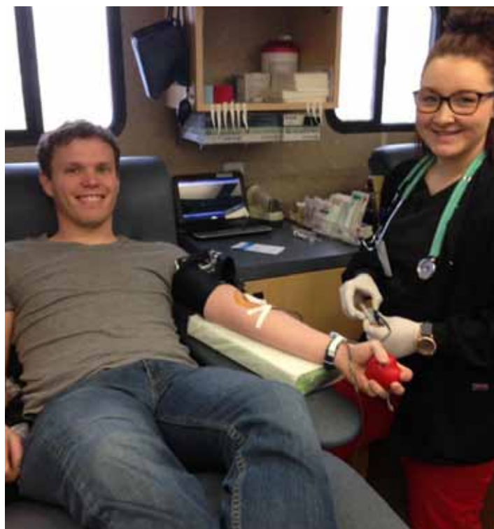
Nebraska Community Blood Bank