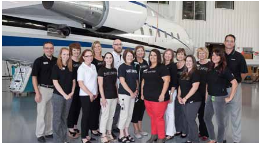
Lincoln staff at the 2016 United Way/CHC Campaign Kickoff at Duncan Aviation