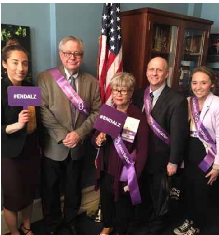
Alzheimer's Association Nebraska Chapter