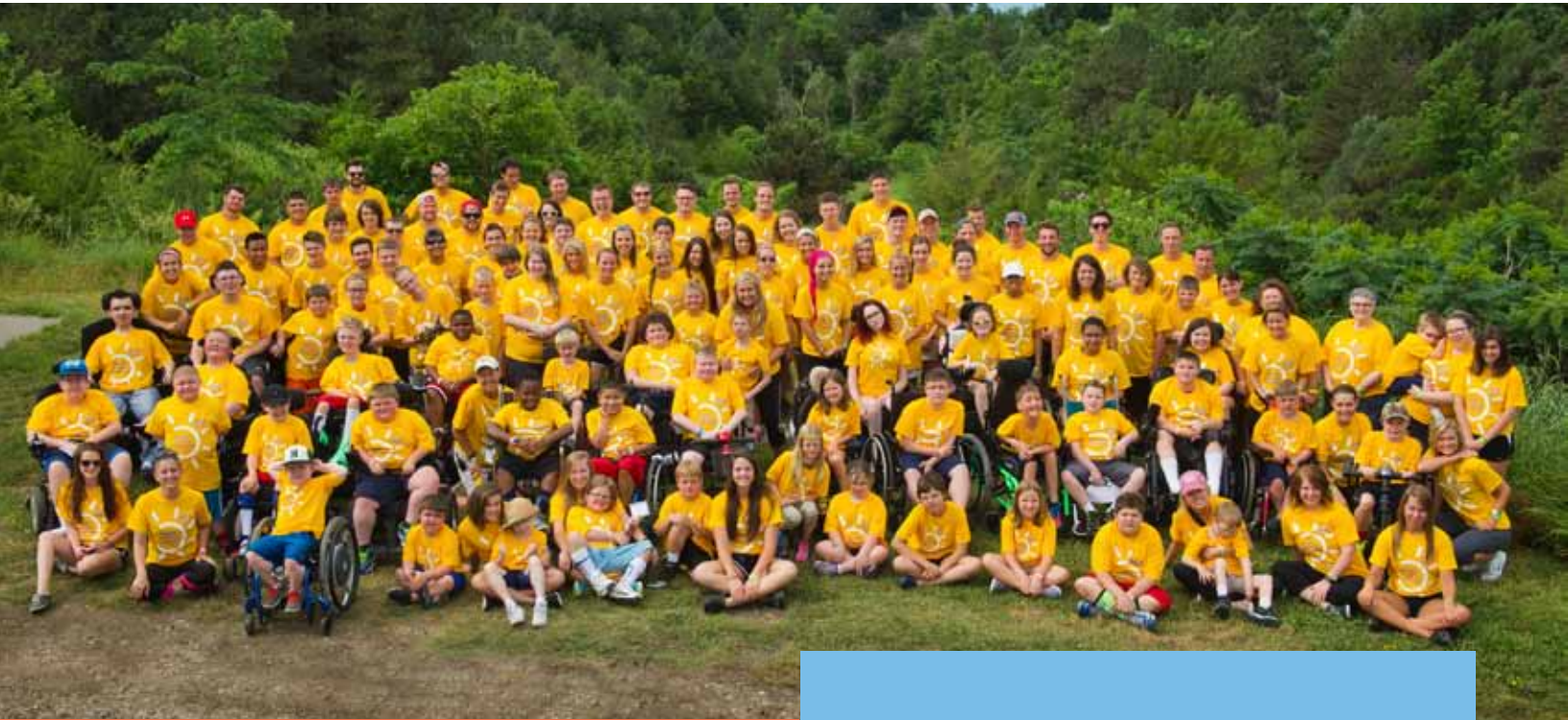
Muscular Dystrophy Association of Nebraska