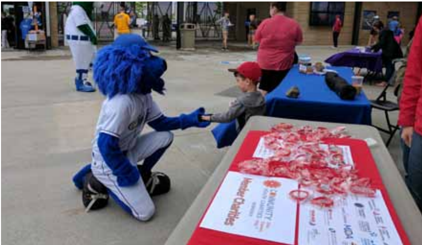
2017 CHC-NE Day at the Omaha Storm Chasers game