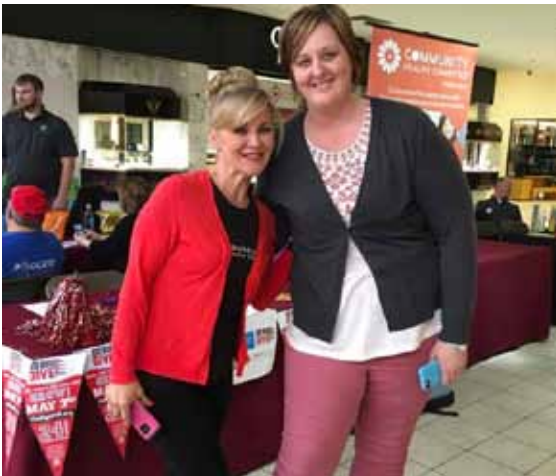
2017 Go Big GIVE event in Grand Island