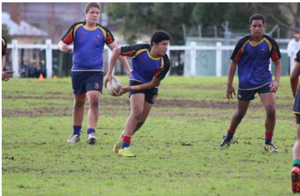
U15A Gold Vikings about to execute a set play!