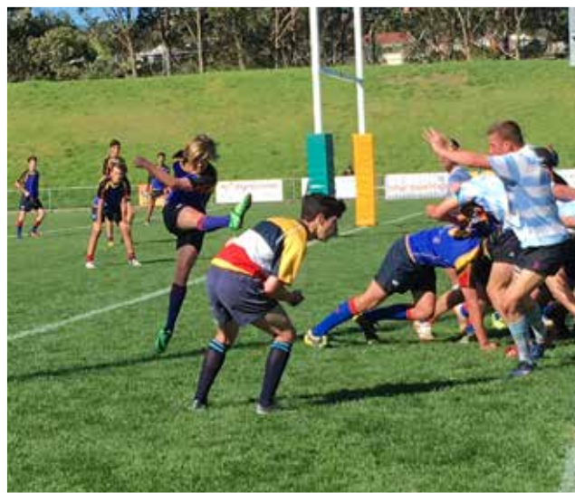
U16 Grand Final