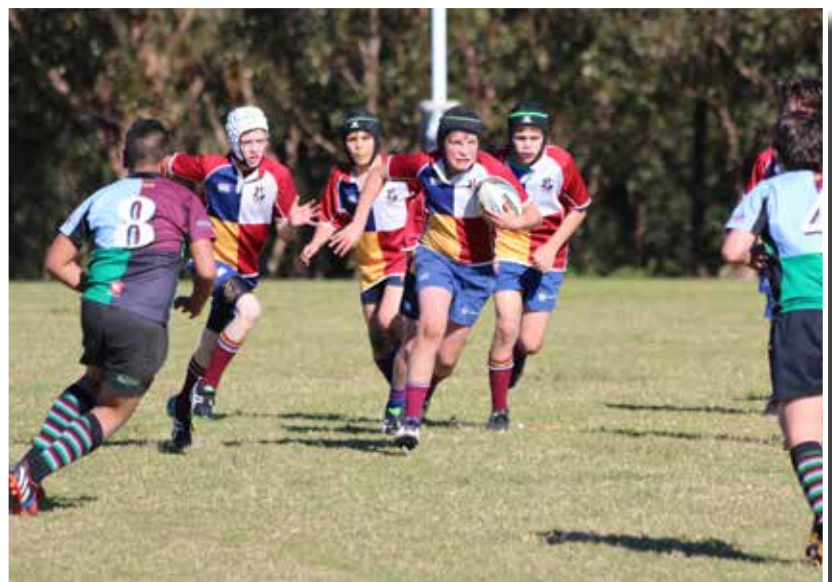
Harbord Harlequins versus Melbourne Harlequins!