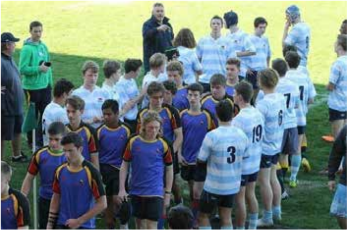
Leaving the field after the U16 Grand Final at Rat Park