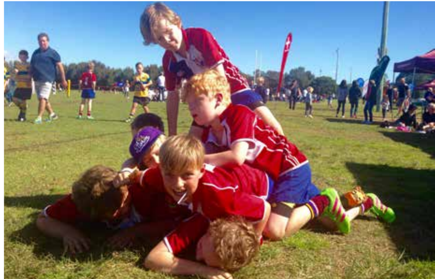
Harlequin's Cup rumble!