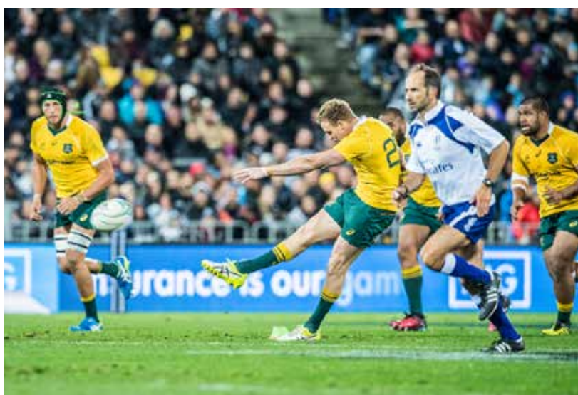
Reece Hodge, a member of the first Harbord Harlequins team in 2001, in his debut Test with the Wallabies in August 2016.