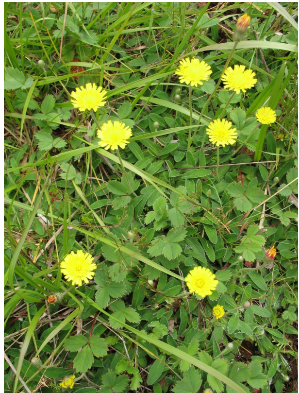
Mouseear hawkweed flowers

Introduction: Mouseear hawkweed is a member of the sunflower family and very similar in growth form to the common dandelion. It is an aggressive weed of grasslands, right of way, pastures, lawns and wastelands. Similar to the other hawkweeds, mouseear hawkweed plants thrive in a wide variety of soil conditions but prefer semi-arid, sunny soils, sandy soils and less fertile sites. Early herbarium specimens were collected from cemeteries, lawns and wastes areas therefor it is assumed to have arrived from Europe in packing material and not as a seed contaminant. There are reported medicinal properties associated mouseear hawkweed including old, modern and specific remedies for internal and external use. Currently the literature is conflicted as to the plant’s allelopathic properties. The dense mats do create a ‘halo’ around them but this effect is a resulting change of moisture, pH and carbon increases in the soil the plants and not from a chemical extruded by the plants themselves (McIntosh, P. et al., 1995), (Dobson and Scot 1985). Some Internet sites still offer the plant for sale, though sale and delivery to Oregon is prohibited. It is currently listed as a noxious weed in three states though occurring in twenty-four states mostly in the eastern US. Mouseear hawkweed is not a USDA federally listed noxious weed.