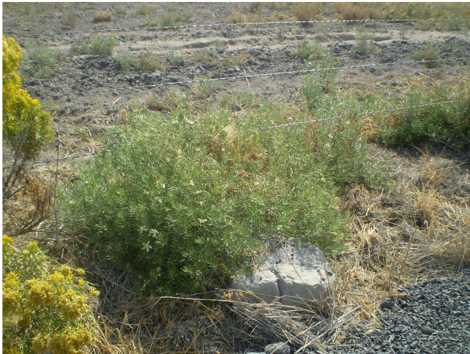
Harney County infestation

Introduction: African rue is a USDA federally listed noxious weed. A member of the Caltrop family and native to the deserts of Africa and Southern Asia, it has become invasive in parts of the Southwest United States. The seeds yield a red dye (“Turkish red” or “Syrian red”) long used in Persian carpets (Davidson and Wargo). It was introduced and has naturalized in parts of New Mexico, Arizona, Texas, California, and Washington. In Oregon, infestations occur in Crook and Harney Counties (Rasmussen per com 2009). Until 2008, the Crook County site was the only confirmed Oregon infestation.