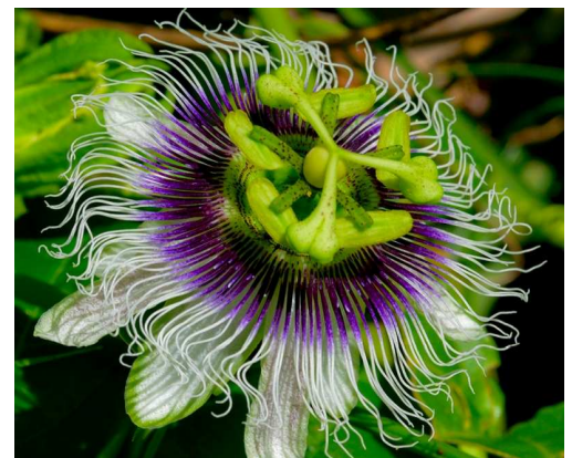
“Passion Fruit Flower” B Grade Open Merit Ed Giddings