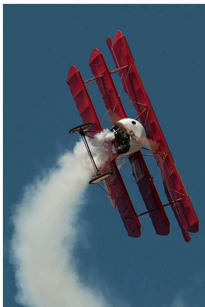
“Smoking Hot” B Grade Print Merit Shirley Fittkau.