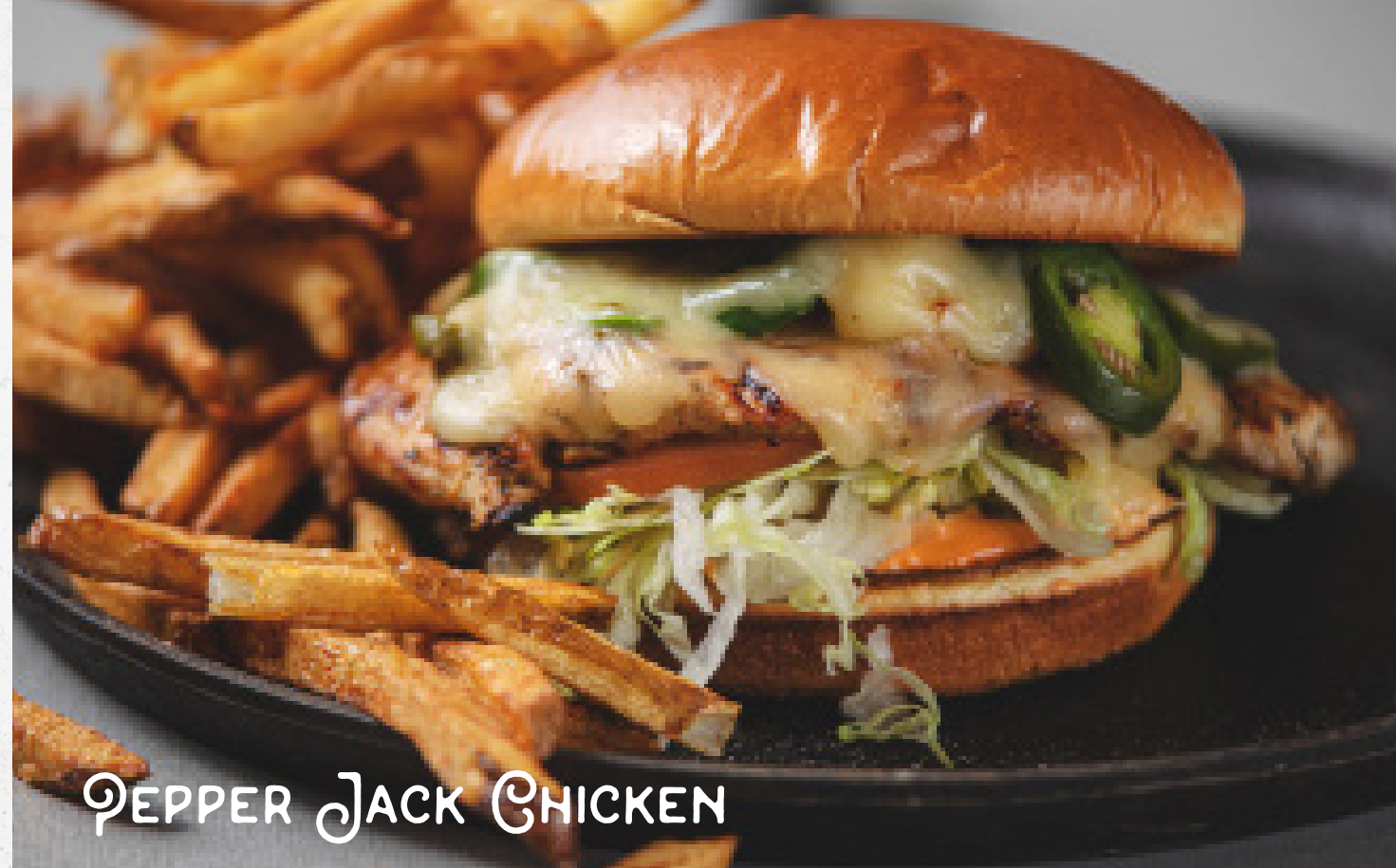
PEPPER JACK CHICKEN