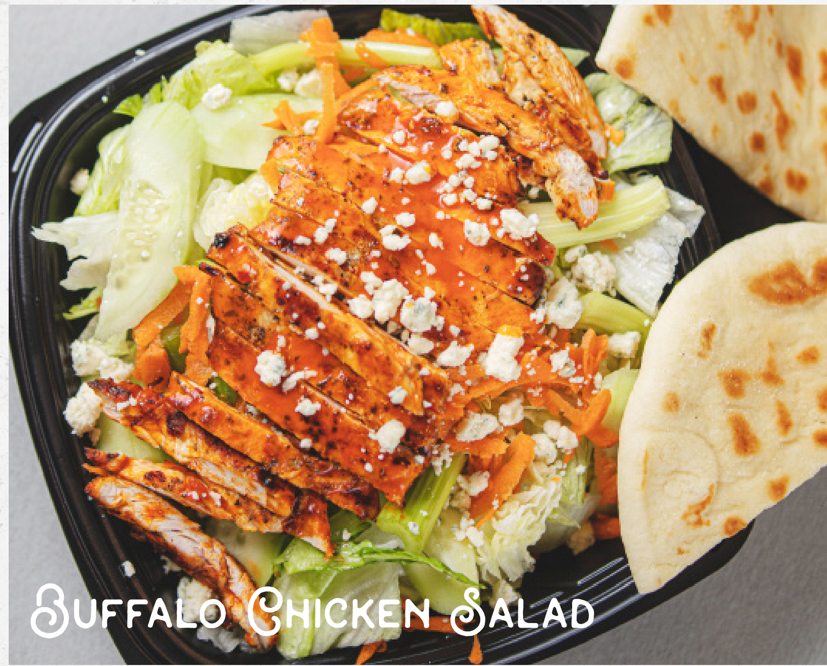
BUFFALO CHICKEN SALAD