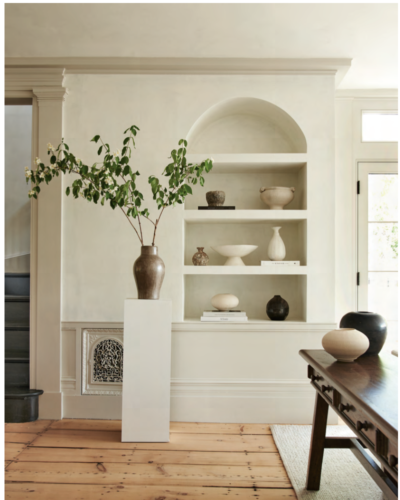
Opposite: A built-in shelving unit creates a pretty hub to display vintage ceramics. The wooden console that backs the sofa was found on 1stdibs. Benjamin Moore's Sea Salt defines the restored trimwork against the home's plaster walls.