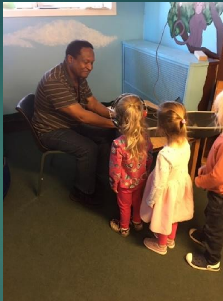
Vision and Hearing Testing Dental Hygiene Lessons