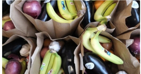
Example of the fresh produce in Saskatchewan's Apple-a-Day program (2022).

The health care sector has an important leadership role to play to meet the urgent challenge and high cost of food insecurity. Health care leadership is needed to guide work across sectors with partners and government agencies to provide more comprehensive social and health support that wrap-around individuals, families, and communities.