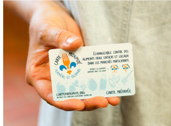
Example of the Carte proximité in Montreal (2022).

Toronto: Black Creek Community Health Centre is launching a 4-month food prescribing project for 15-20 households in the Jane and Finch neighbourhood of Toronto. It will run from November 2022 - February 2023, with a pre/post-measurement strategy to understand impacts on food security using indicators from the Maple Leaf Centre for Food Security evaluation frameworks. Criteria for selection is households with children who have been screened as food insecure. These households will receive gift cards that can be redeemed for 2 food boxes per month containing fresh fruits and vegetables, delivered to their homes.