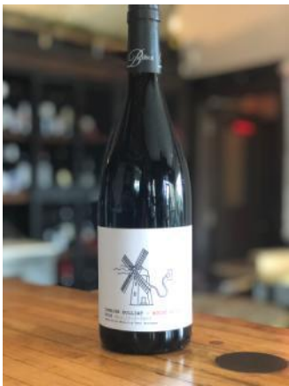
2018 'Roche Noir' Moulin a Vent, Domaine Bulliat 47 BEAUJOLAIS, FRANCE (GAMAY)

if you're thinking of buying this you already know why so we're not going to bother with a cryptic description