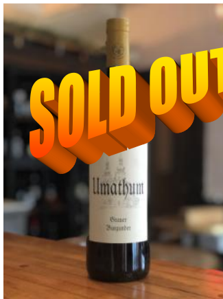
2017 Grauer Burgunder, Neusiedlersee, Umathum 25 BURGENLAND, AUSTRIA (PINOT GRIS)

rich but fresh, lush but balanced, just-ripe tropical fruit, a bit of sage & savoury