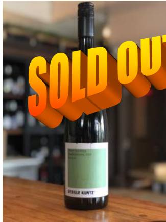
2014 Riesling Qualitätswein, Sybille Kuntz 45 MOSEL, GERMANY (RIESLING) It's the last bottle of the 2014...tastes good...buy it