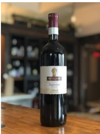
2018 Saperavi, Marani 35 KAKHETI, GEORGIA (SAPERAVI)

tangy and juicy and a slight spritz on the get-go...this is "glou glou" incarnate