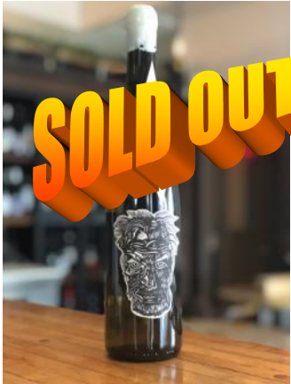
2016 'Orbitofrontal Cortex', Blank Bottle 45 WESTERN CAPE, SOUTH AFRICA (GRENACHE BLANC, FERNÃO PIRES, CHENIN BLANC, ++) complex & creamy, aaaaannd the last bottle