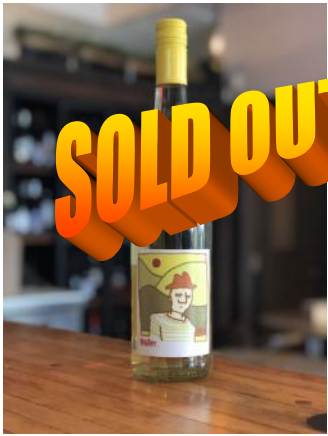
2016 Müller-Thurgau, Enderle & Moll 30 BADEN, GERMANY Stone fruit, tropical fruit, white pepper, fresh but soft finish...young & yummeeeee