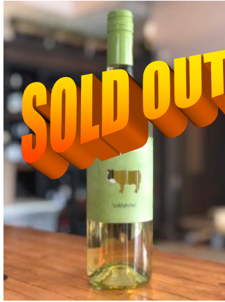
2016 'Sziklafeher', Meinklang 32 SOMLÓ, HUNGARY (HARSLEVELÜ, JUHFARK, OLASZRIZLING)

light , crisp acidity, lemon, peach and apricot with a touch of toasty vanilla