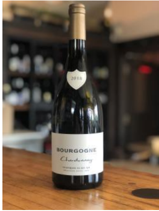
2018 Bourgogne Chardonnay, Vignerons de Bel-Air 40 BURGUNDY, FRANCE (CHARDONNAY)

light , crisp acidity, lemon, peach and apricot with a touch of toasty vanilla