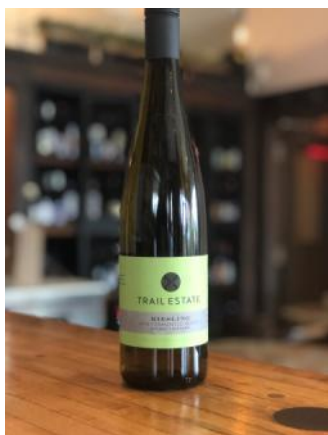
2017 Riesling, Skin Contact, Trail Estate 37 PRINCE EDWARD COUNTY, CANADA (RIESLING)

soft texture, subtle spice, green pear, delicate almond skin, bit of a sultry creature