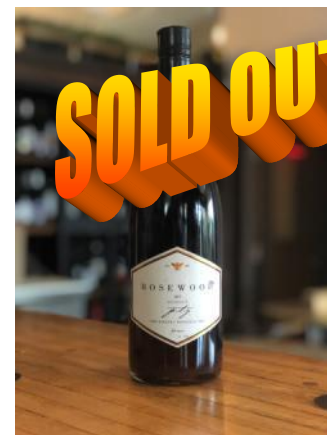
2017 'Notorious PTG', Rosewood Estates 27 NIAGARA, CANADA (GAMAY, PINOT NOIR)

juicy but dry forest berries and cherries, a touch of spice and smooth finish