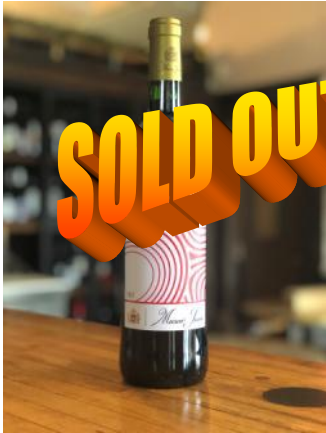
2017 'Jeune' Rouge, Chateau Musar 48 BEKAA VALLEY, LEBANON (CINSAULT, SYRAH, CABERNET SAUVIGNON)

raspberry, black cherry, elderberry, hibiscus, balanced, good tannins, incense-like spice