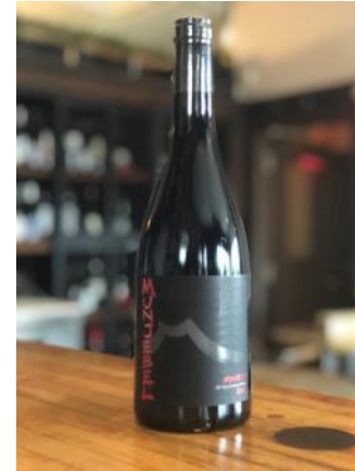
2017 'Munjebel Rosso', Siciliane Rosso IGP, Frank Cornelissen 80 SICILY, ITALY (NERELLO MASCALESE)

raspberry, black cherry, elderberry, hibiscus, balanced, good tannins, incense-like spice