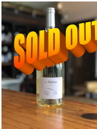
2018 'Le Sabina', Cotes du Roussillon, Clos Del Ray 35 LANGUEDOC-ROUSSILLON, FRANCE (GRENACHE BLANC, VERMENTINO)

volcanic soils, light & invigorating with stoney minerlity and a whiff of lime leaf