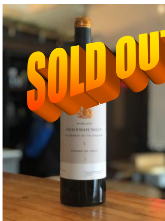
2017 'Les Pierre de Grès,' Pacherenc de Vic-Bilh AOP, Domaine Berthoumieu 35 MADIRAN, FRANCE (GROS MANSENG, PETIT COURBU, PETIT MANSENG)

dry, bright citrus, steely minerality, chalky texture, underlying richness, precise finish