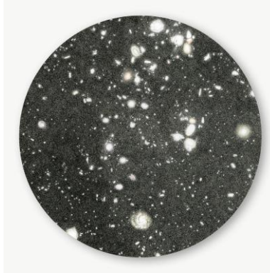
Ultra Deep Field , Mia Rosenthal