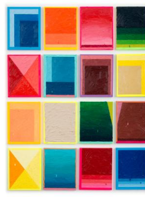
YORBGrid , Russell Tyler