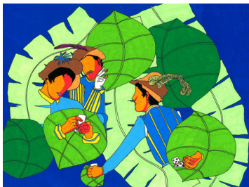
MMDC5 (Michelangelo Merisi da Caravaggio #5), acrylic on paper, 12.6" x 9.4"