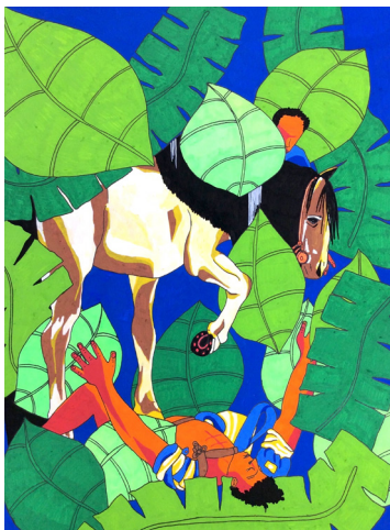
MMDC10 (Michelangelo Merisi da Caravaggio #10), acrylic on paper, 12.6" x 9.4"