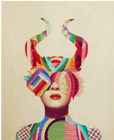
Athena, oil on canvas, 33" x 25"