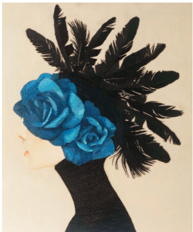
Lady Peacock, oil on canvas, 40" x 36"