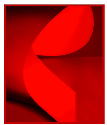
Untitled #5, photography, digital printing, 70.89" x 59.05"