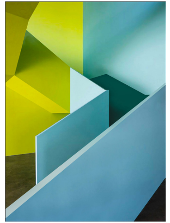
Untitled #8 , photography, digital printing, 78.74" x 57.08"