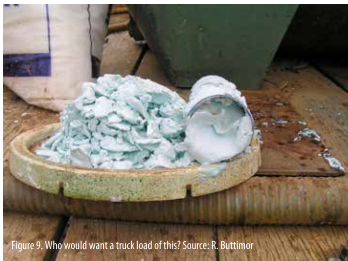
Figure 9. Who would want a truck load of this?

or EDTA (edetic acid). This covers up hard water ions that may cause incompatibility issues.