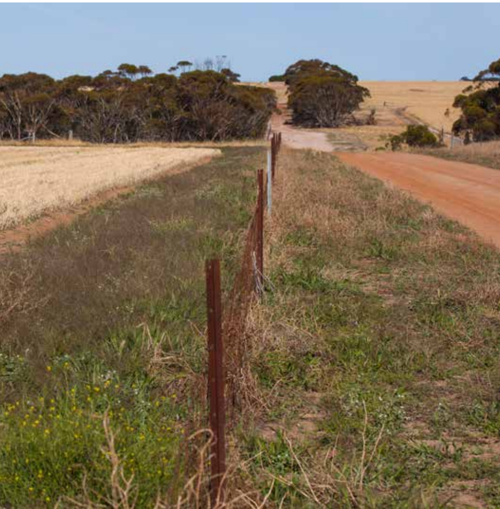
Figure 4. Remnant wild radish and summer weeds taking over fence line near Lake Grace.