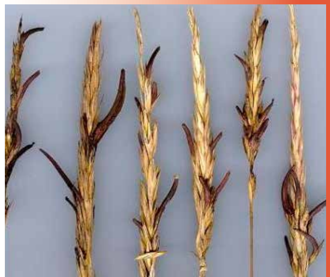
Figure 2. Ergot in cereal rye.

If you are a fan of 'dry seeding', and many WA growers are, knowing if your herbicides still work is particularly important.