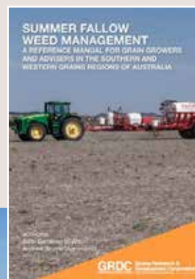
Figure 11. Click to see entire booklet.

This publication covers all aspects of summer fallow management from the benefits through to what to use.