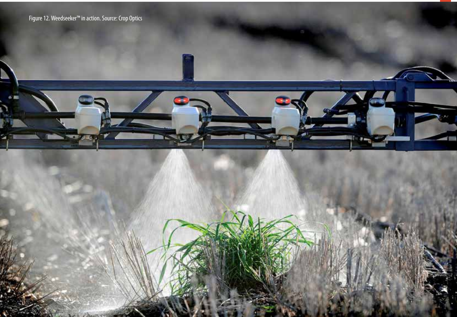
Figure 12. Weedseeker™ in action.

While OSST is great for these hard to control weeds, only young, actively growing weeds should be sprayed.