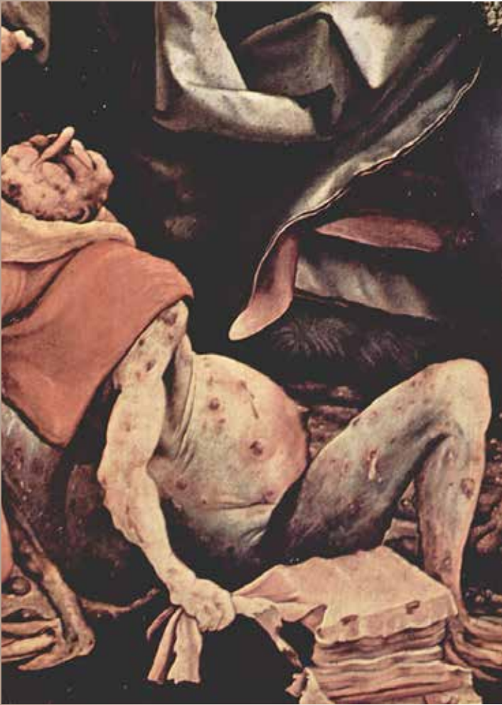
Figure 3. Part of the Isenheim Altarpiece painted by Matthias Grunewald circa 1512 showing a victim of St Anthony's fire – ergotism.

Knowledge is power, so now is the time to find out what you are dealing with.