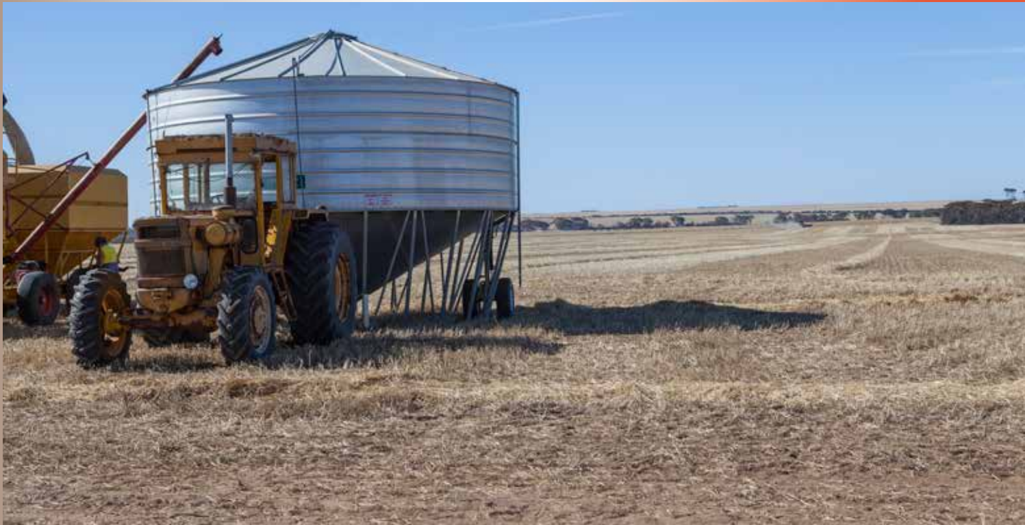
Figure 1. Seed grading to reduce ryegrass ergot in the grain sample, southern WA.

This indicates we are close to a tipping point when glyphosate resistance is likely to start becoming obvious in cropping paddocks.