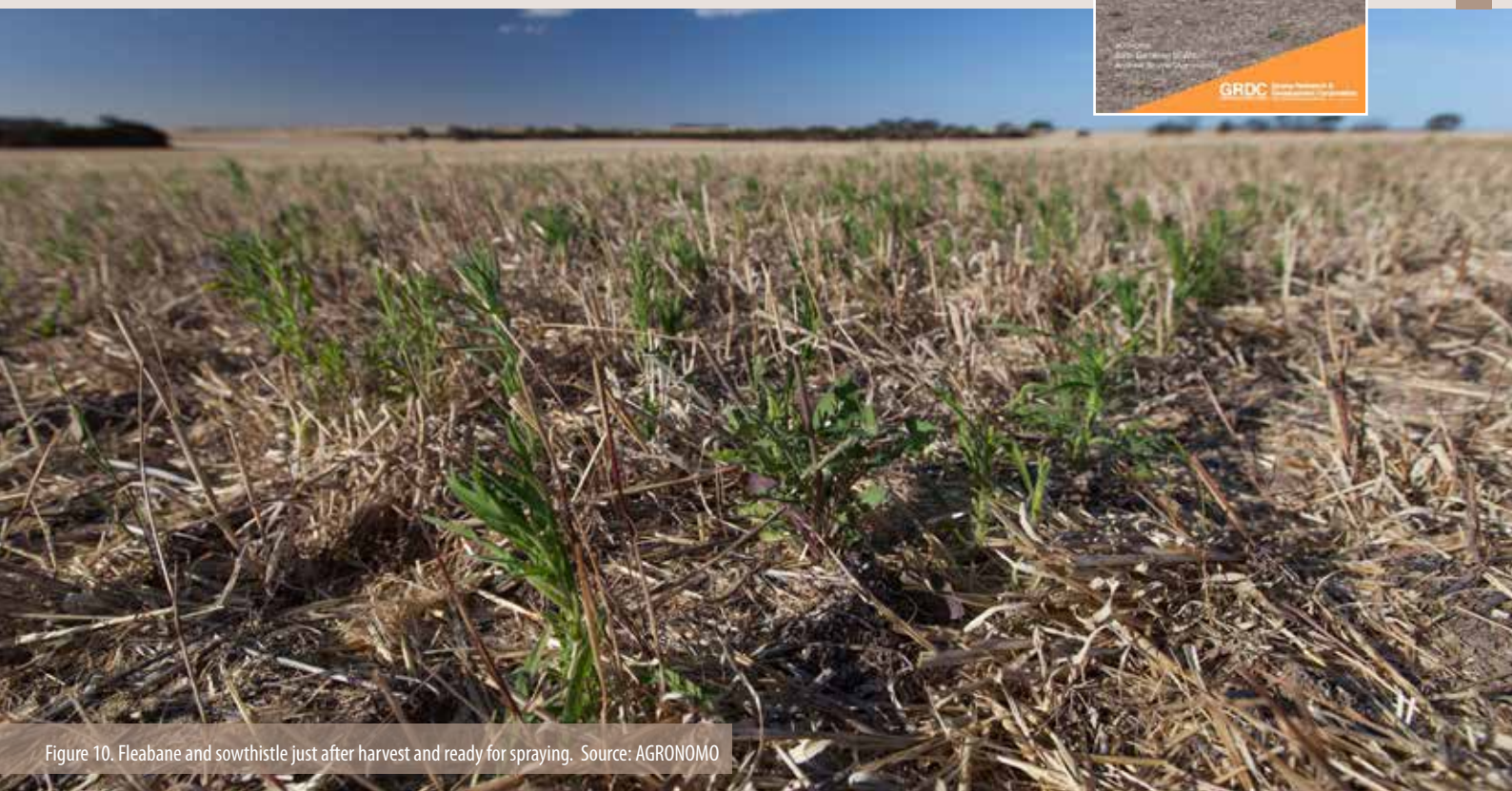
Figure 10. Fleabane and sowthistle just after harvest and ready for spraying.