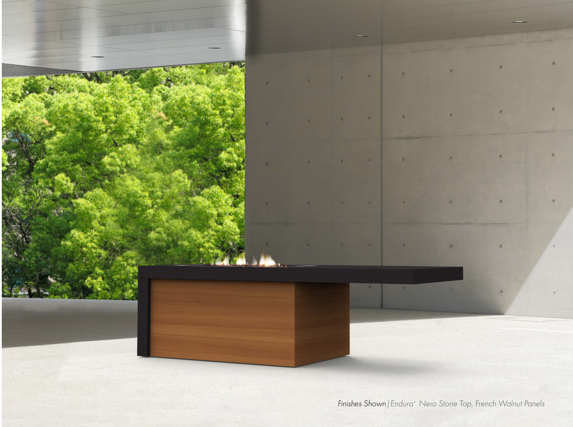
Finishes Shown | Endura+ Nero Stone Top, French Walnut Panels