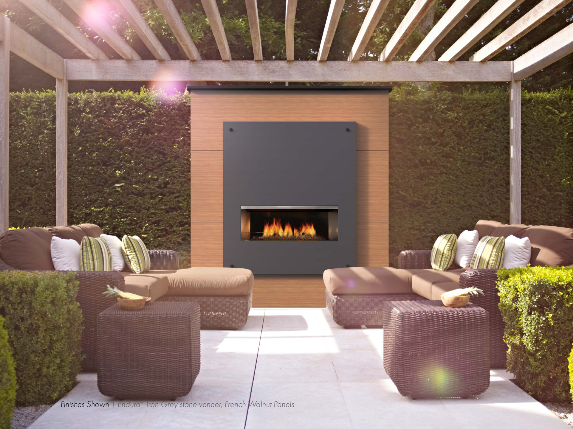
Finishes Shown | Endura™ Iron Grey stone veneer, French Walnut Panels