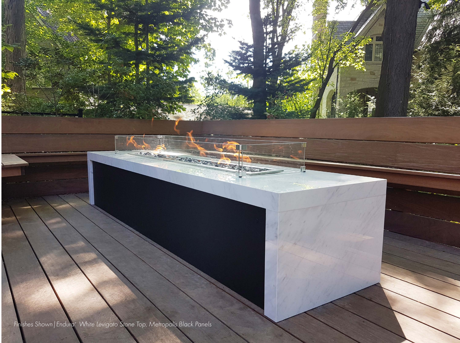
Finishes Shown | Endura + White Levigato Stone Top, Metropolis Black Panels