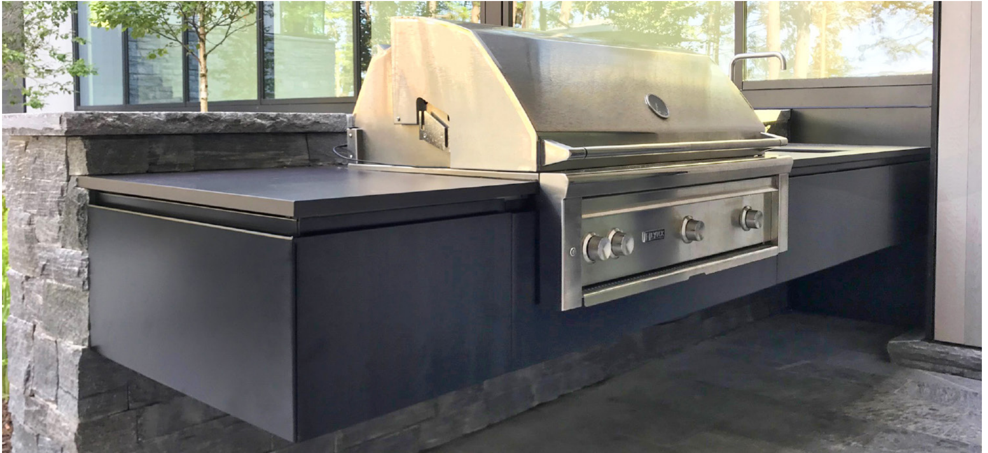
Features | 1.5" Premium countertop, weighless float installation, integrated pull tabs, sink prep Finishes | Endura® Domoos , Matte Black powdercoated cabinets