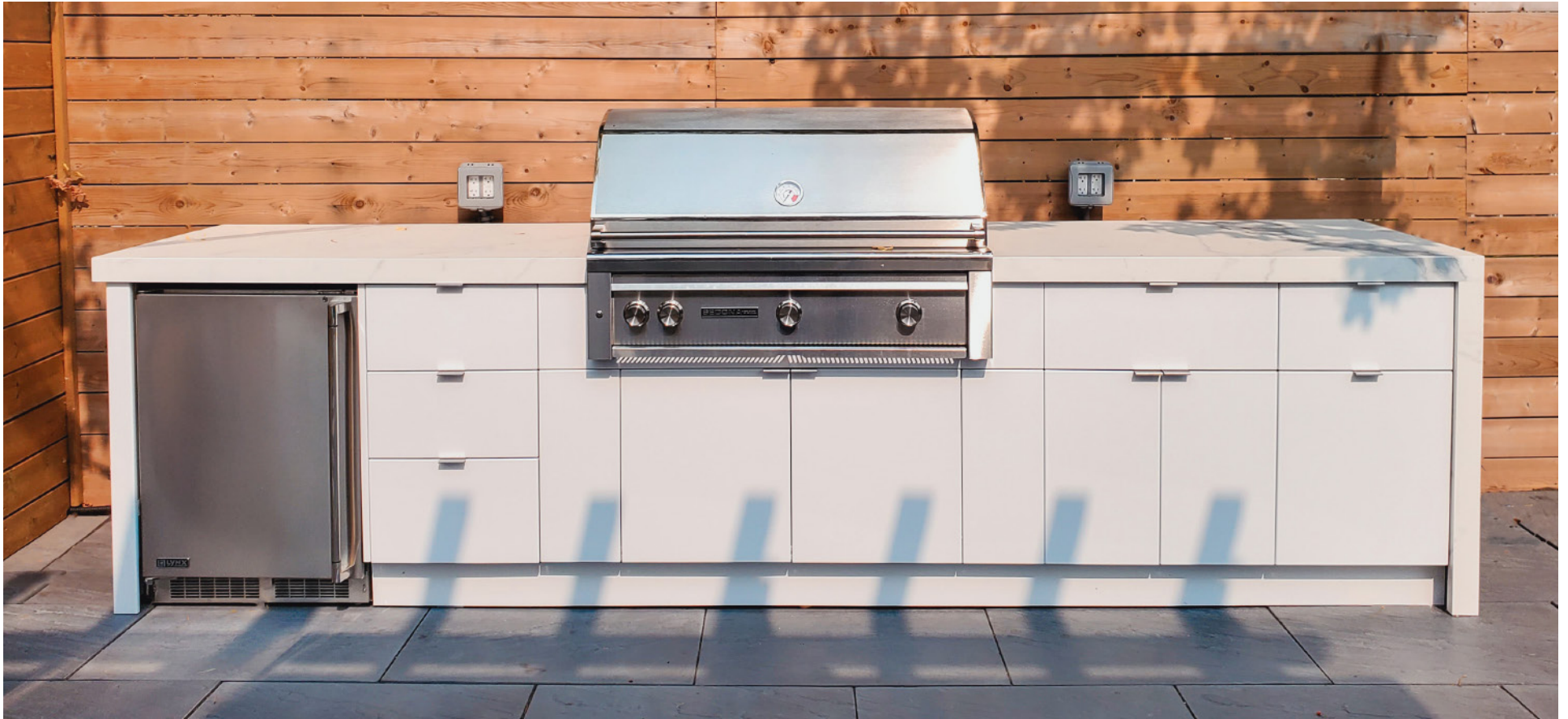
Features | 2.5" Premium countertop + dimensional waterfall end, utensil drawers, waste + recycle drawer, storage Finishes | Endura® Calacatta Statuario countertop, Matte White powdercoated cabinets