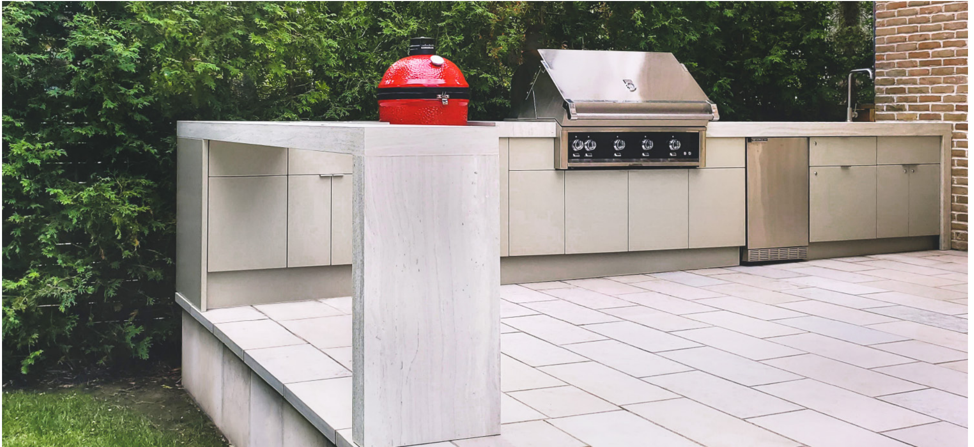
Features | 3.5" Premium countertop + dimensional waterfall ends + seating, Kamado Joe smoker, sink and storage with locks Finishes | Endura® Strata Argentum , Nevada Hybrid powdercoated cabinets