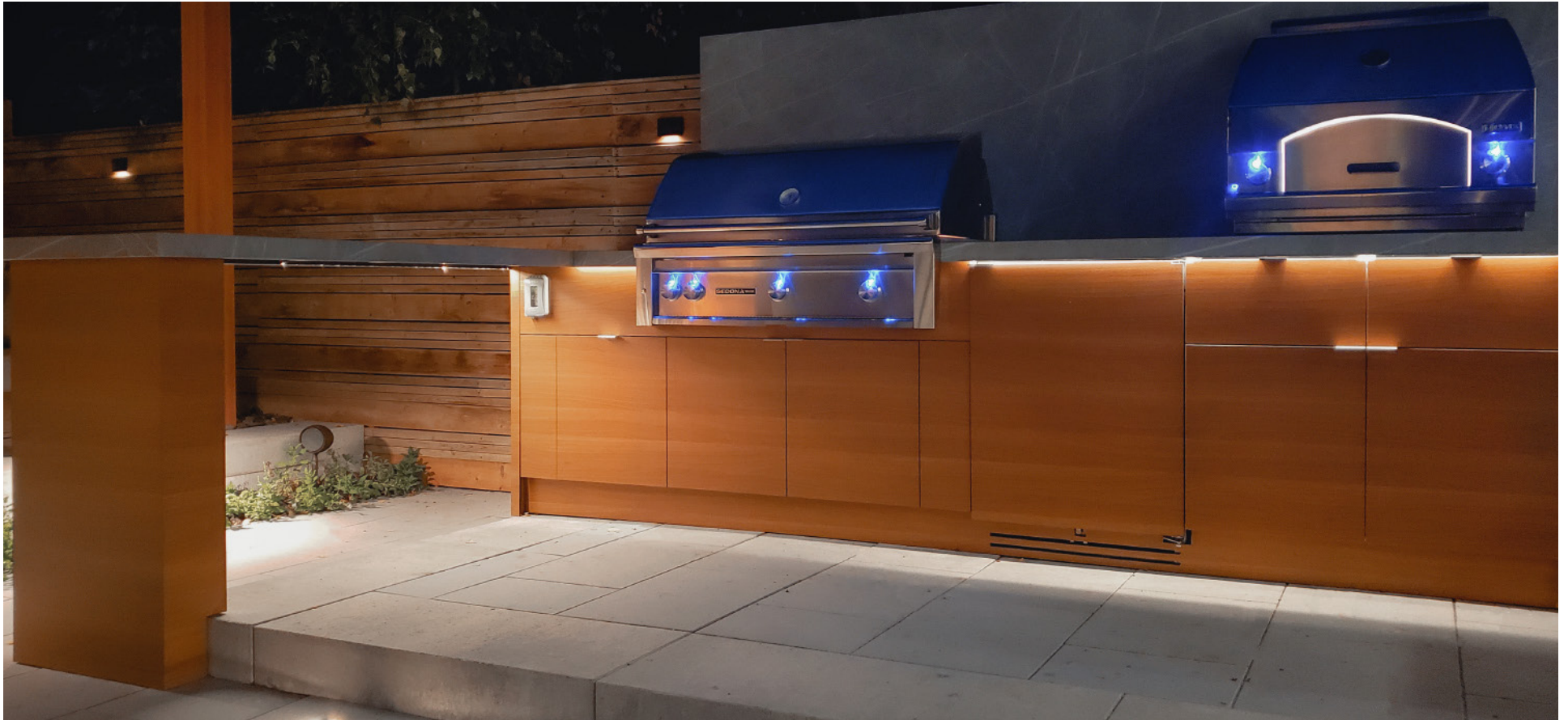
Features | Under-edge LED lighting for dramatic night ambience , continuous wood grain finish, cabinetry clad refrigeration, bar seating Finishes | Endura® Zaha Stone countertop, Italian Walnut cabinets