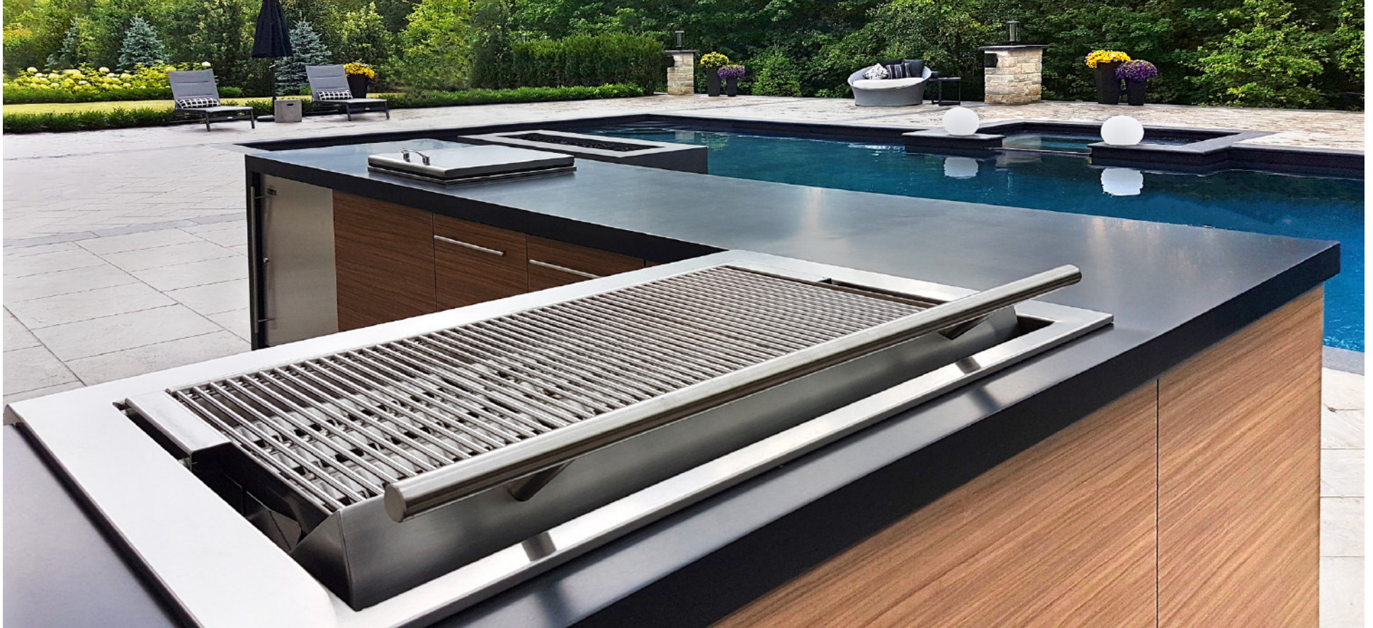
Features | Social grill, beverage cooler, fridge, storage & waste drawers Finishes | Endura® Domoos countertop, French Walnut cabinets