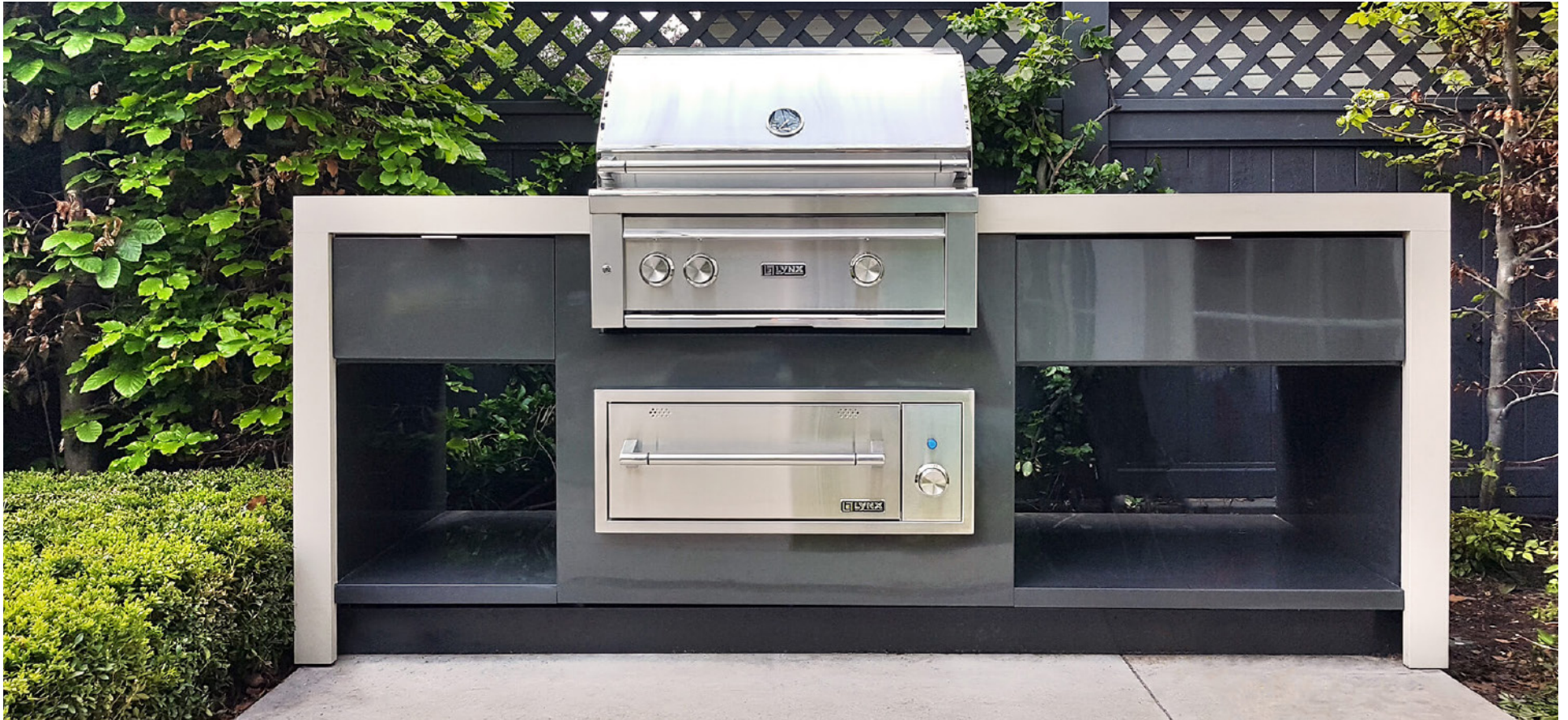
Features | 2.5" Edge premium countertop + dimensional waterfall ends, custom open cabinetry, warming drawer + utensil drawers Finishes | Endura® Calce Avorio , Custom RAL powdercoated cabinets