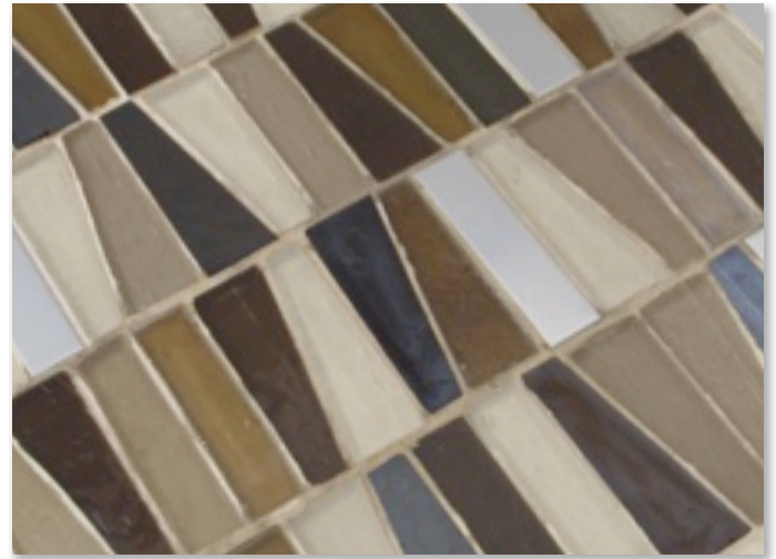
BARNEGAT LIGHT AM-LH-BL