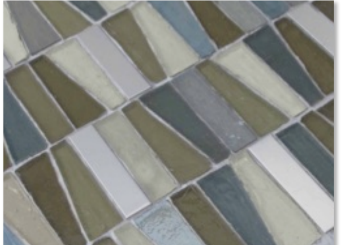
CAPE HATTERAS AM-LH-CH