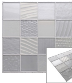
SILVER SALTS AM-MT-SS