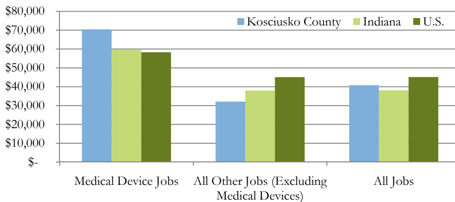
Figure 3: Average Wage per Medical Device Job and All Jobs, 2009

Source: IBRC, using Bureau of Labor Statistics data