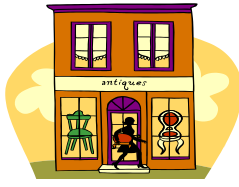
Antiques & Treasures