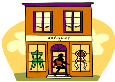
"Tiques & Treasures"