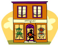
Tiques & Treasures