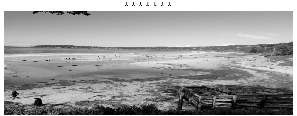
November Surf does not always sweep the beach clean

[Please note, listings reflect only new and renewed memberships and contributions since the Fall Issue of the Newsletter. If your contribution is not listed, please look for it in the Spring Newsletter. Generally, the Spring Issue lists memberships and contributions for December, January, February, and March. There are no listings in the Summer Issue because of space constraints (Poetry Prize winners are published in the Summer Issue). The Fall Issue contains memberships and contributions from April through August of any given year, and the Winter Issue lists September through November memberships and contributions.]