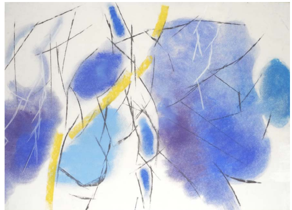
De León, Standing Female Figure