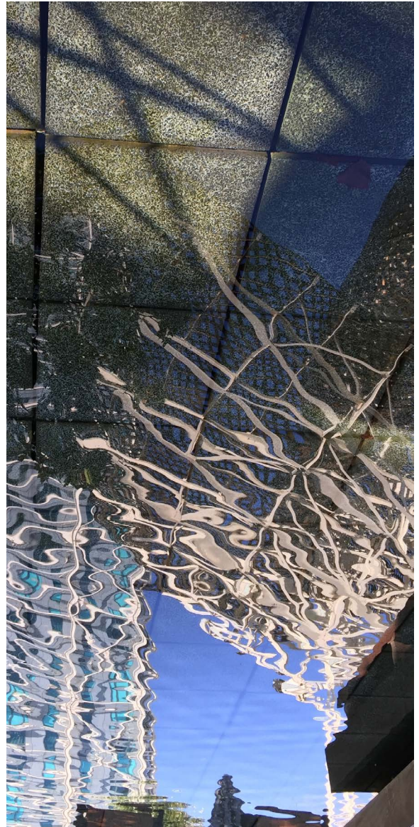
De León, Barcelona 4

Nick de León: Drawing on Life is at No 20 from September 1 to 22.