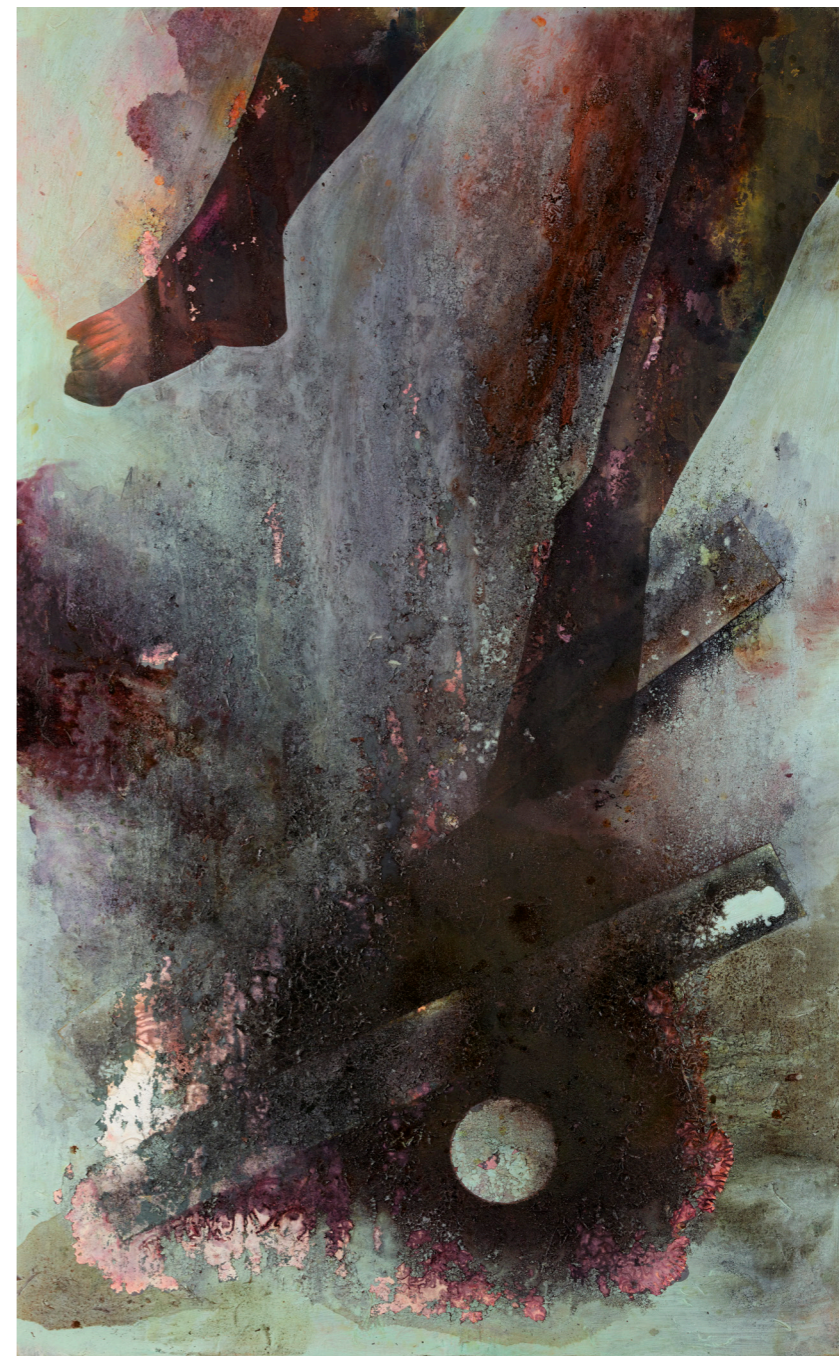
Submergence (2021), Oil on canvas, 200 x 125 cm