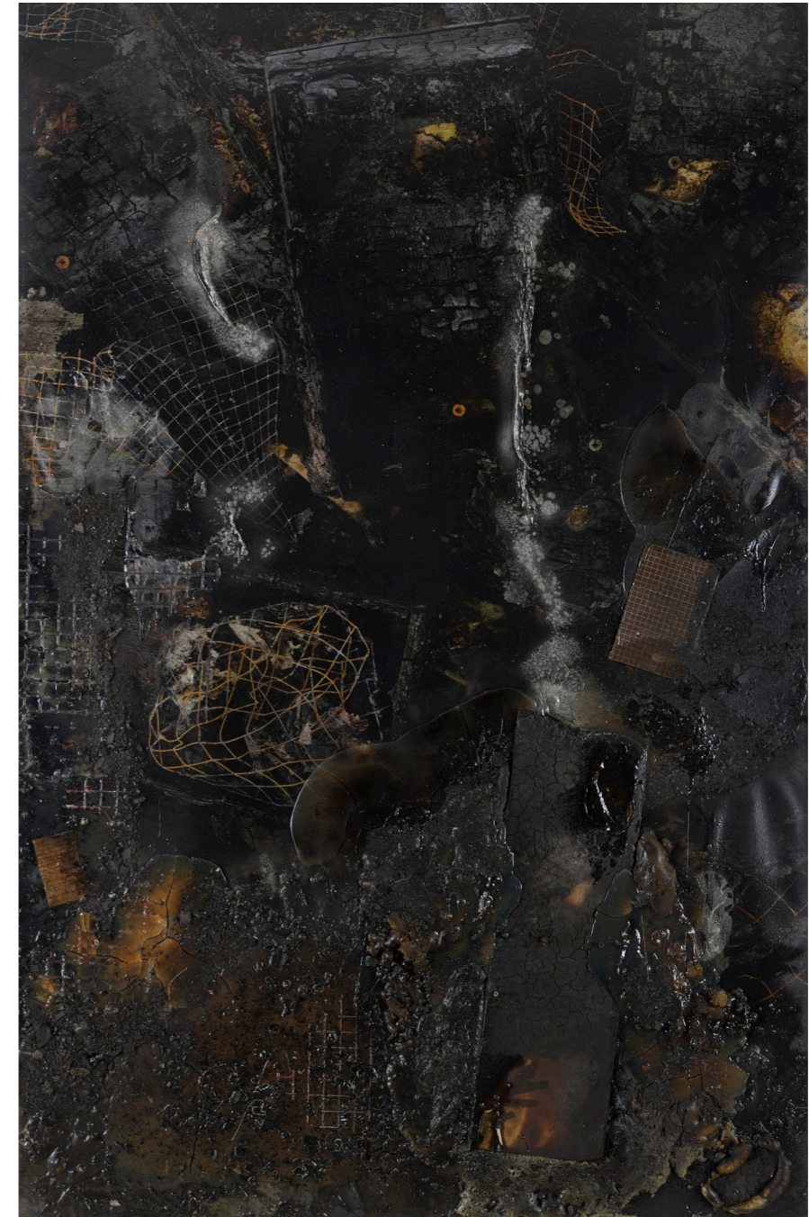
Wreckage I (2021), Oil on canvas, 200 x 125 cm

Most of all it's an attempt to work beyond design, to move away from the certainty, noise and violence of my previous work. To strip everything back, from overt displays of horror towards beauty and melancholy. To think of paint as poetry, a language of associations, a medium capable of holding multiple metaphors at once. To paint into feeling.