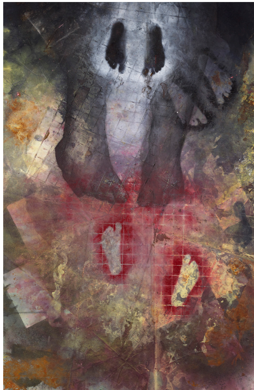
At the cliff edge (2021), Oil on canvas, 200 x 125 cm