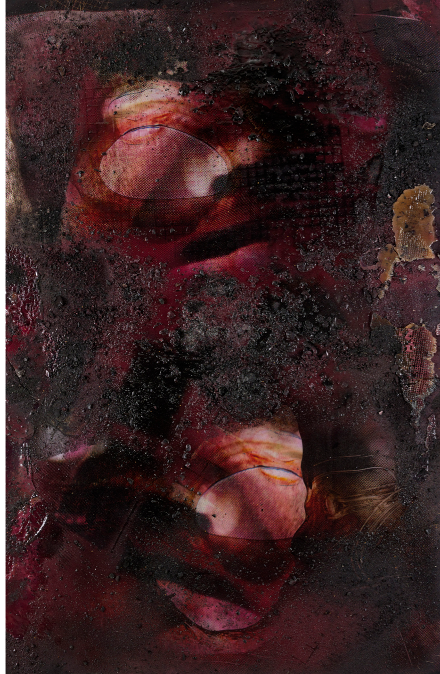
Mirror II (2021), Oil on canvas, 200 x 125 cm