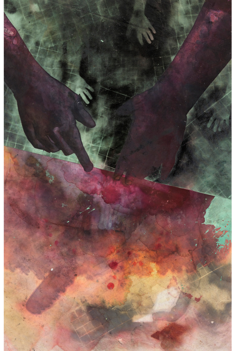
Cave (2021), Oil on canvas, 200 x 125 cm