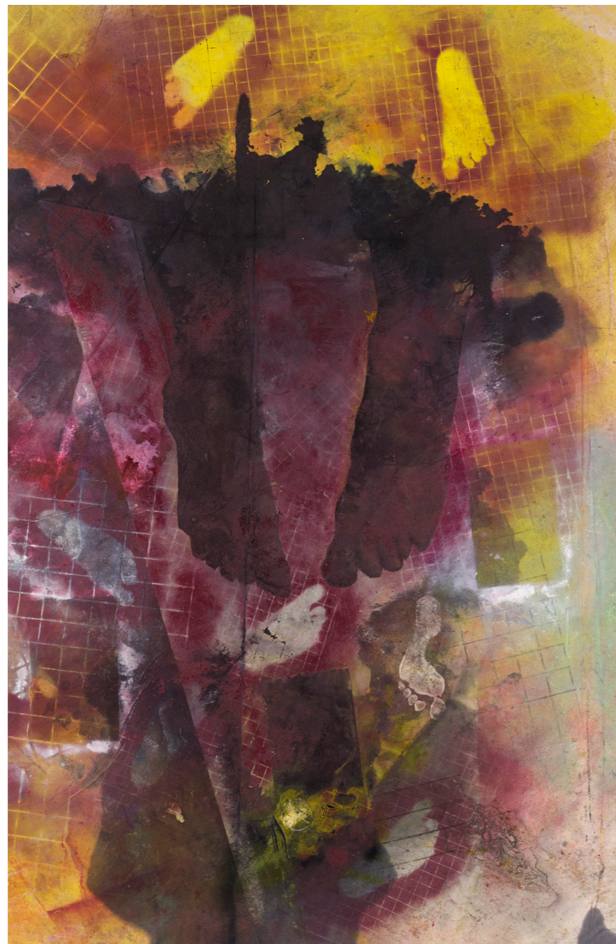
Gravity (2021), Oil on canvas, 200 x 125 cm