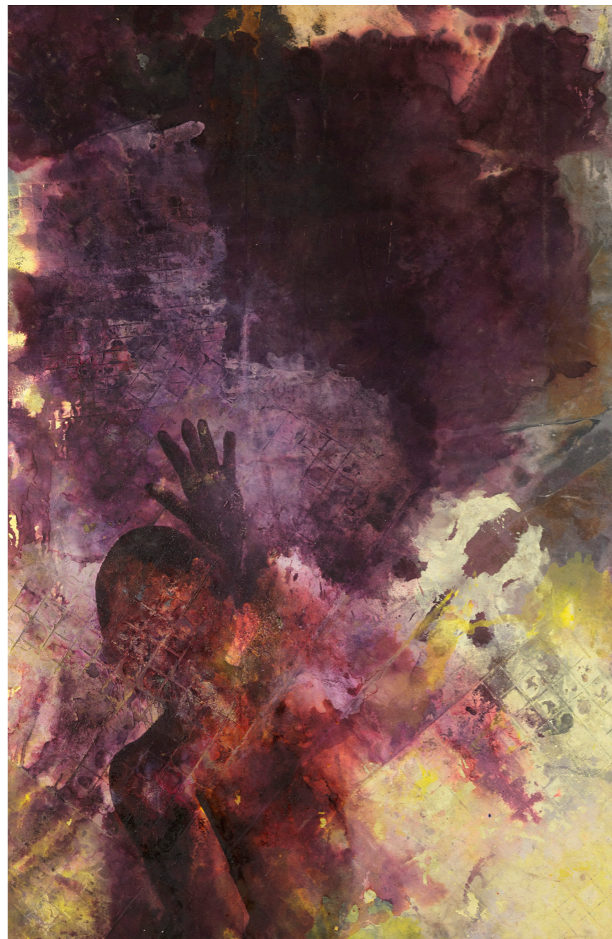
Raft (2021), Oil on canvas, 200 x 125 cm