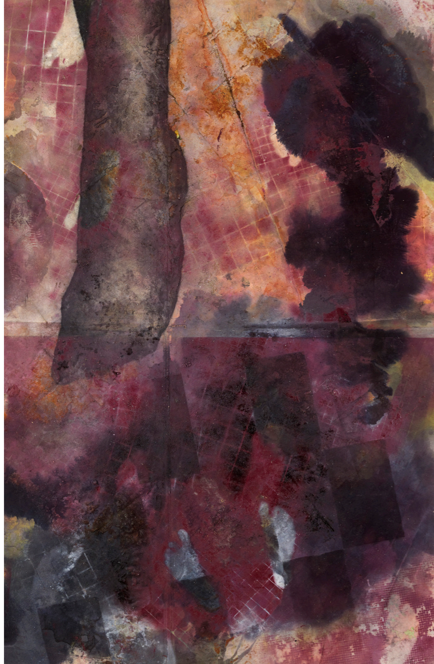
Rupture (2021), Oil on canvas, 200 x 125 cm