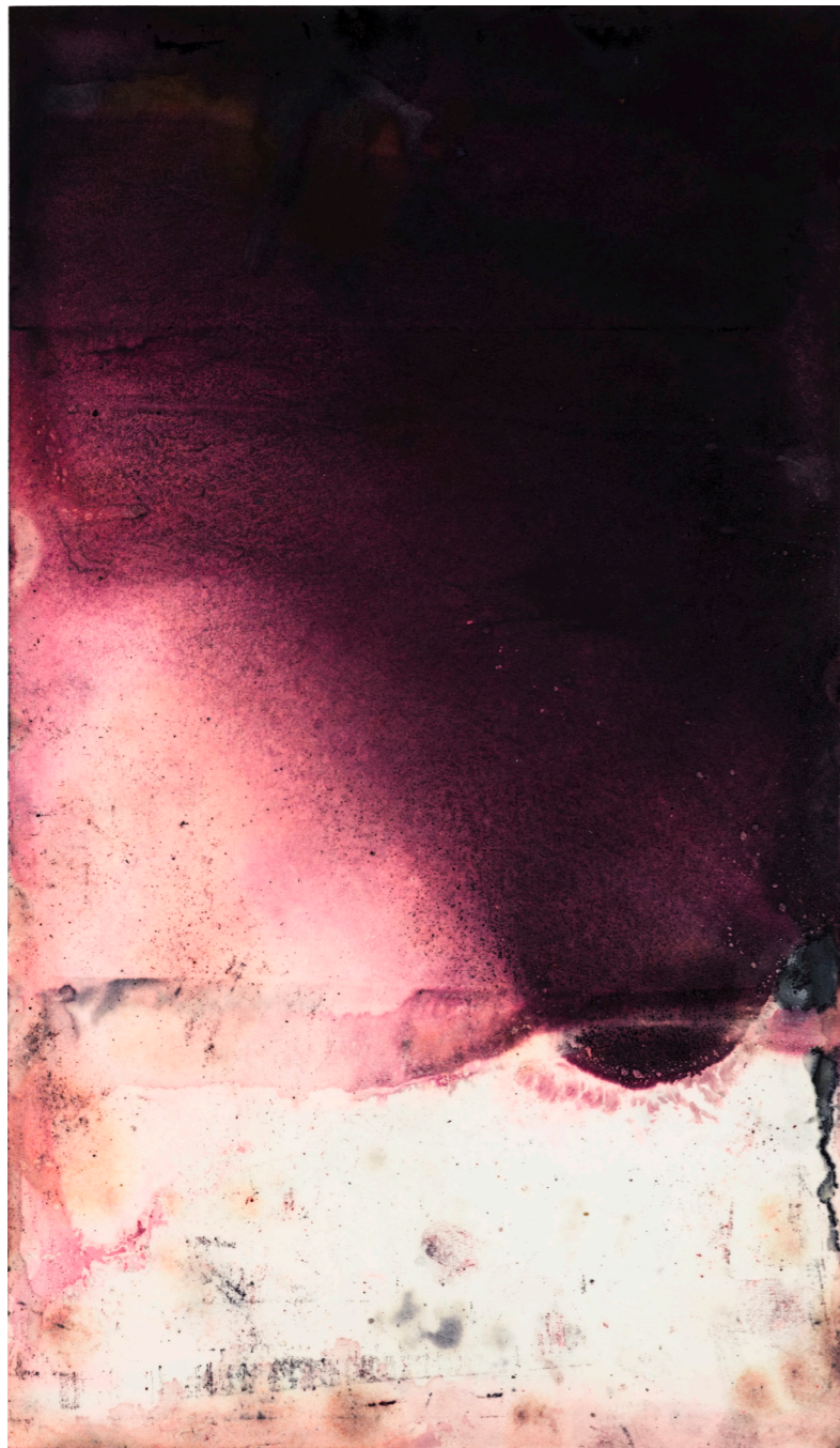
Lens (2021), Mixed media on paper, 29.3 x 17 cm