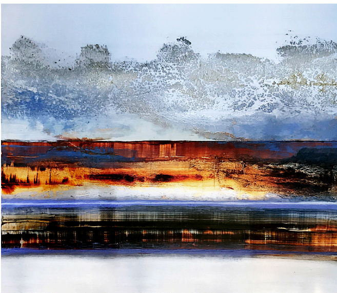
Valkyr I (2022), Mixed media on folded aluminium panel, 85 x 72.5 cm