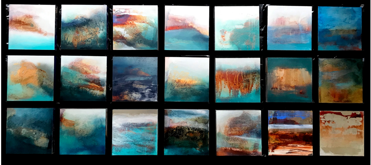
Proteus Collection (2022), Mixed media on aluminium, 20 x 20 cm

No 20 Arts 20 Cross Street London N1 2BG