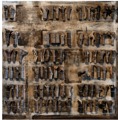
Raymond Attfield City Plan I (2015) Twigs from various trees, some burned in wildfires on waxed and stained particle board, 50 x 50 cm