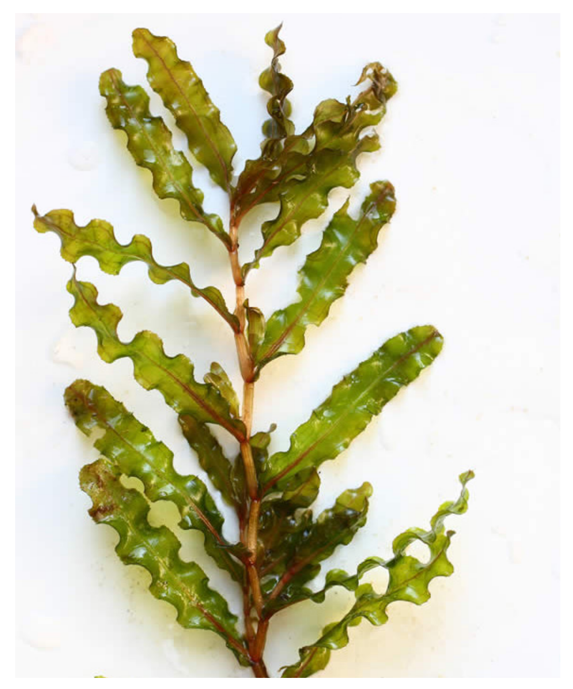
Identify CLP based on its "lasagna noodle" leaves and serrated leaf edges

If you suspect you have found CLP in your lake, please <u>contact</u>our Lake Monitor Coordinator for verification.