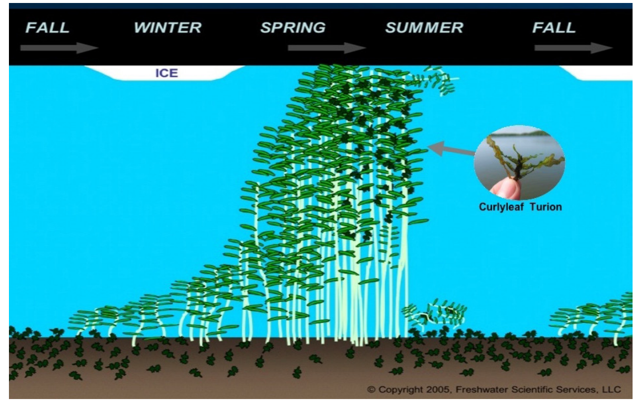
CLP life cycle