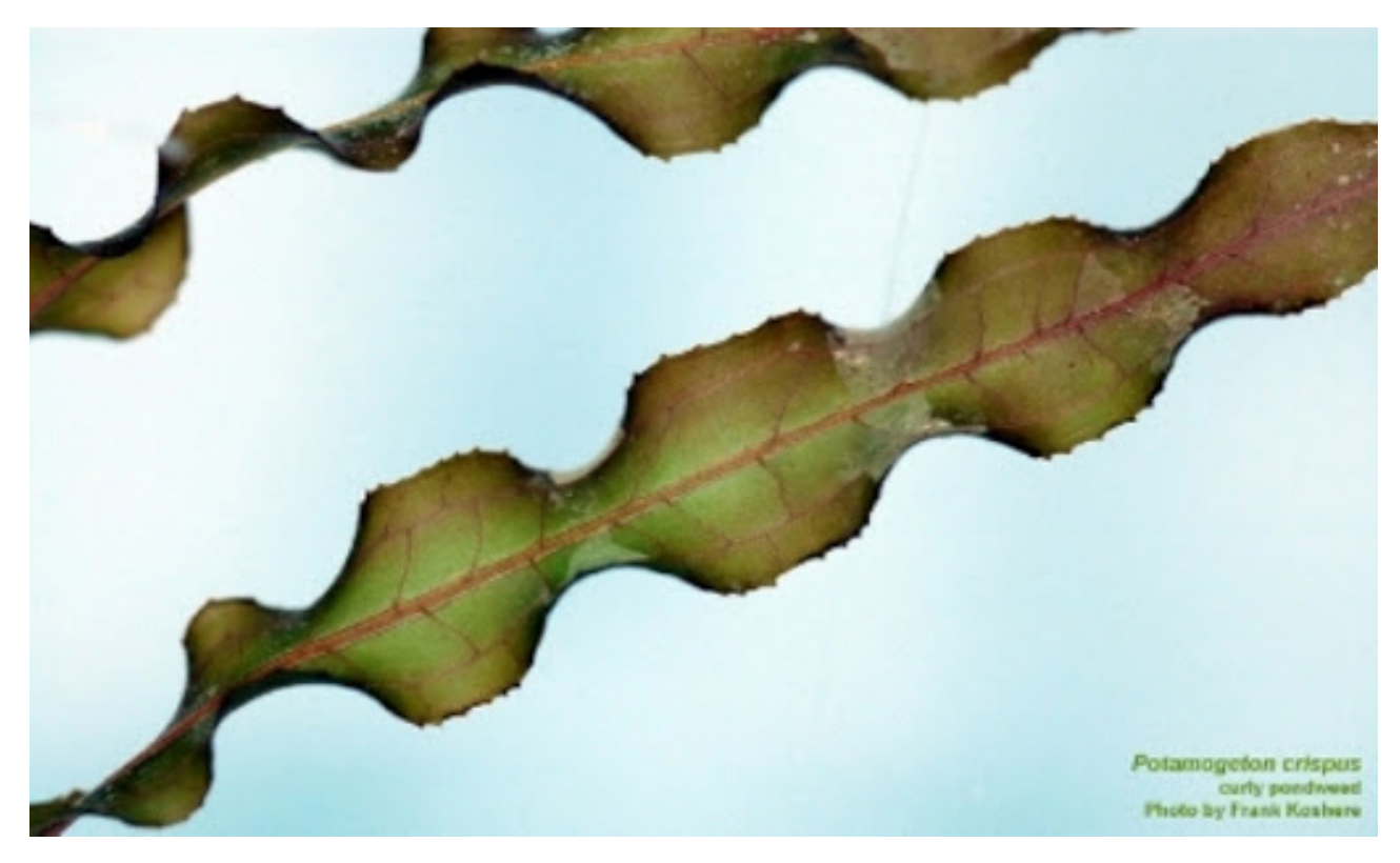
CLP up close - note the serrated leaf edges