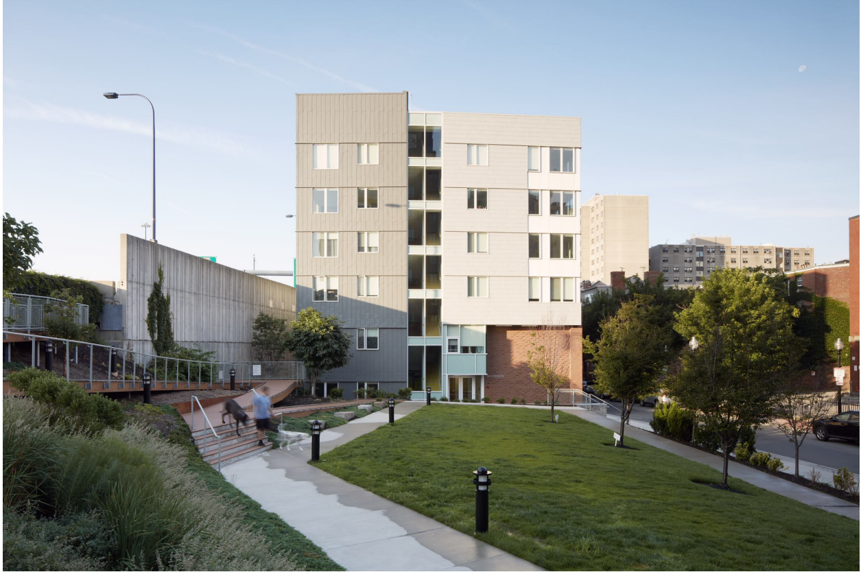
View from 66 Hudson looking south