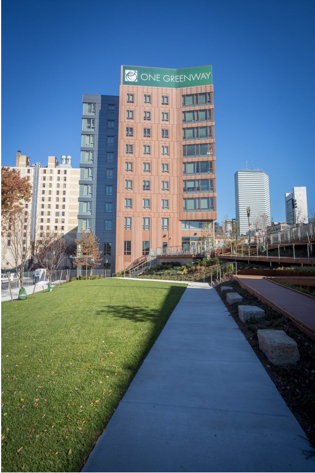
View from 88 Hudson looking north